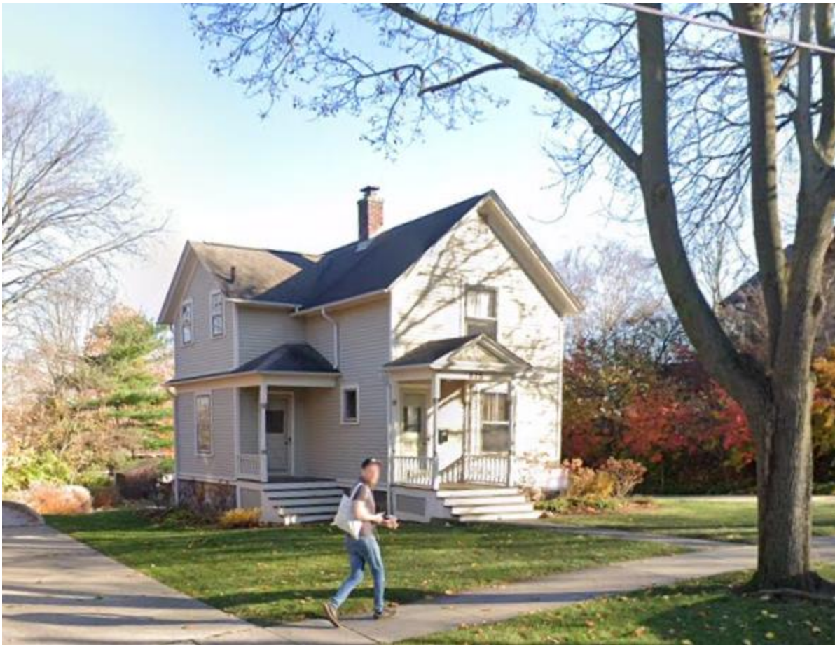
625 Third Street (2020 Google Street View)