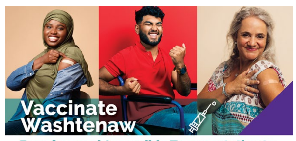
Fare-free and Accessible Transportation to Your Appointment

Another way to improve access to healthcare has been by through investing more in telehealth services. Workit Health, another Ann Arbor-based company is a virtual provider of substance use disorder care. Workit Health recently raised $12 million in its latest