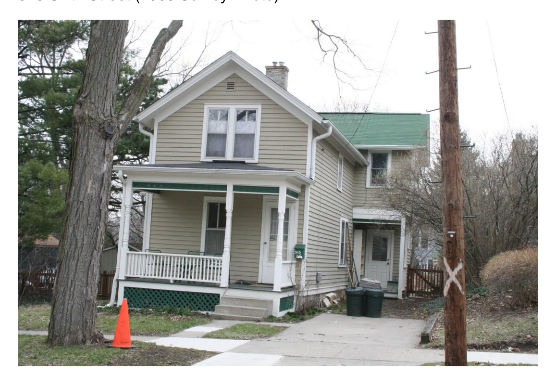
545 Sixth Street (2008 Survey Photo)