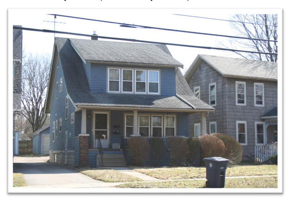
913 W Liberty Street (2008 Survey Photos)