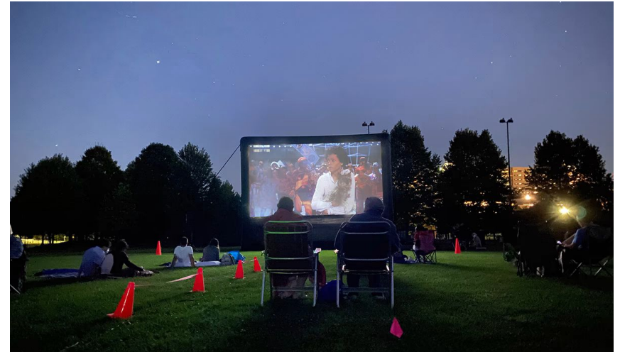
Screening of The Wiz at Fuller Park in 2020