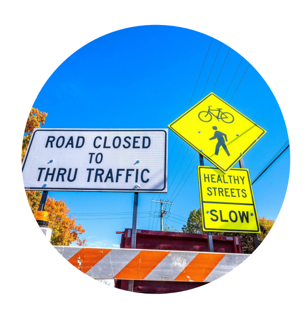
8. Healthy Streets signage