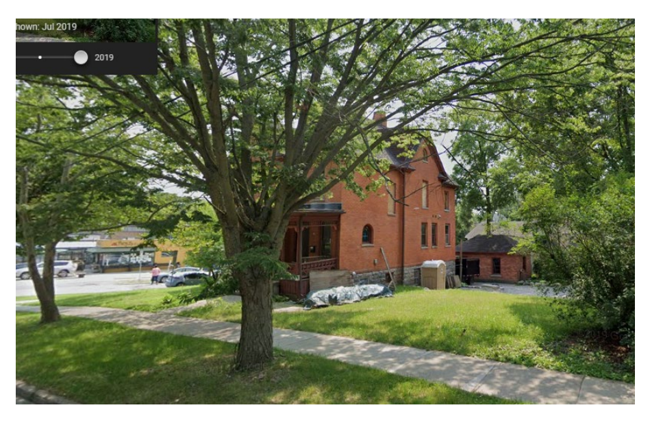
July 2019, courtesy Google Street View