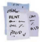
Proof of what you've paid & what you still owe

*Applying for these funds will NOT trigger Public Charge