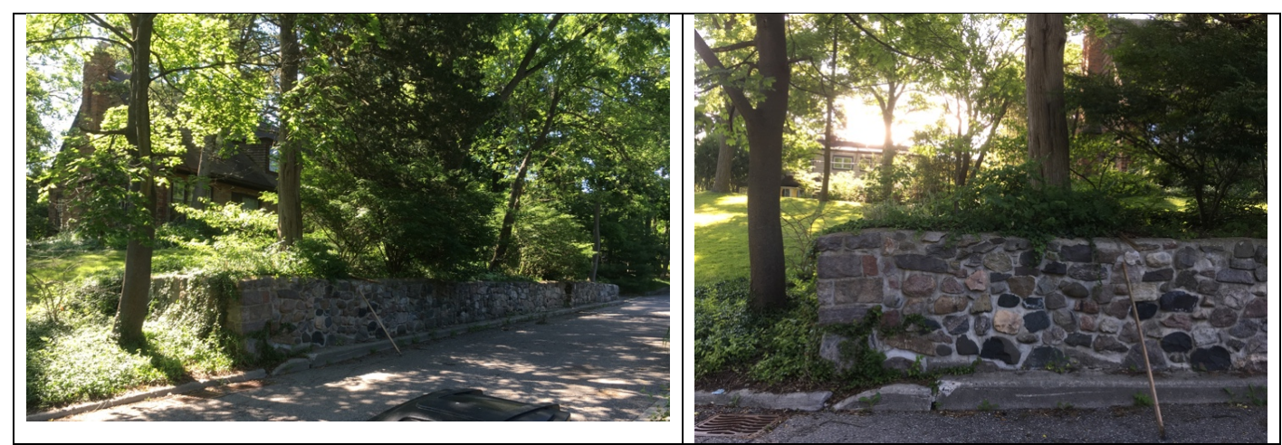
Caption: Photos of June 18-19 showing the whole wall in front of # 3 and part of # 7 Ridgeway and the boundary line established in the May 1994 divide of # 7 from # 3 Ridgeway, marked by the wooden sticks from tip of blue AA City boundary stake in roadway. (Photos: Feeley-Harnik).

These walls still front # 3 Ridgeway (built 1921, current owner: Salvesen) and # 25 Ridgeway (built 1934?, current owner: Coffins).