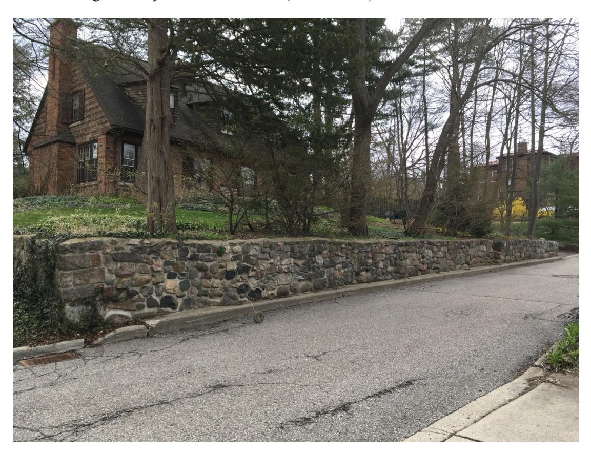
PHOTO : # 3 Ridgeway fronting west on Ridgeway (front door is at far right of facade); driveway opens west on Ridgeway just beyond far end of retaining wall (photo:16 April 2020). NOTE : stone-rope in street marking boundary between #7 and #3 (see D. below).

C. The appeal misrepresents the relationship of lot #7 to lot #3, the lot-house adjacent to its south border, wrongly stating (thumbnail-page 5 of PDF) that "The property to the south is fronting Geddes" as evidence of what it claims is a "key practical difficult[y]" for the #7-owner, that "Essentially [#7] abuts two rear yards and is the only property on this [west]side of the Ridgeway peninsula that fronts towards the west for access to the property. The statement is false; #3 fronts west on Ridgeway, house and driveway alike, presenting absolutely no practical difficulty for #7-owner.