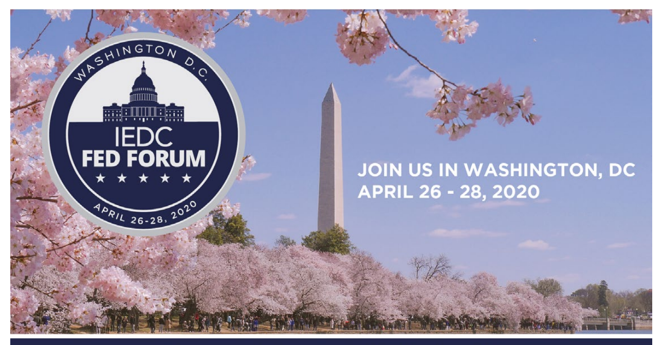
Discover what's new in Washington, DC. The FED Forum is the only annual event focused exclusively on federal economic development policy and programs. Register now at iedconline.org/FEDForum