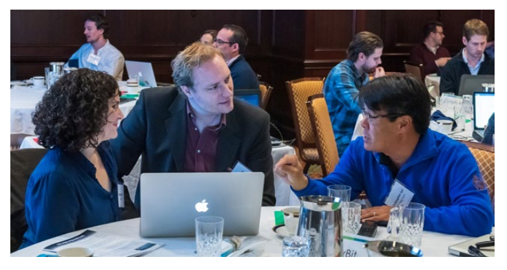
SPARK Entrepreneur Bootcamp participants and mentors participate in Mentoring Days, two intensive days of Lean Startup methodology presentations and one-on-one feedback sessions.

While it is not uncommon for businesses to "fail" during Boot Camp, it is more common for those entrepreneurs to reformulate their ideas and try again. Ultimately, Boot Camp participants experience a shortened time to attract capital, customers, and are more assured of their path to commercialization and confident in the ability to scale in the future.