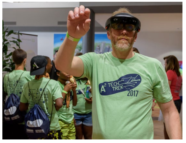
Attendees of A2 Tech Trek get first-hand experience with the technology being developed in the region.