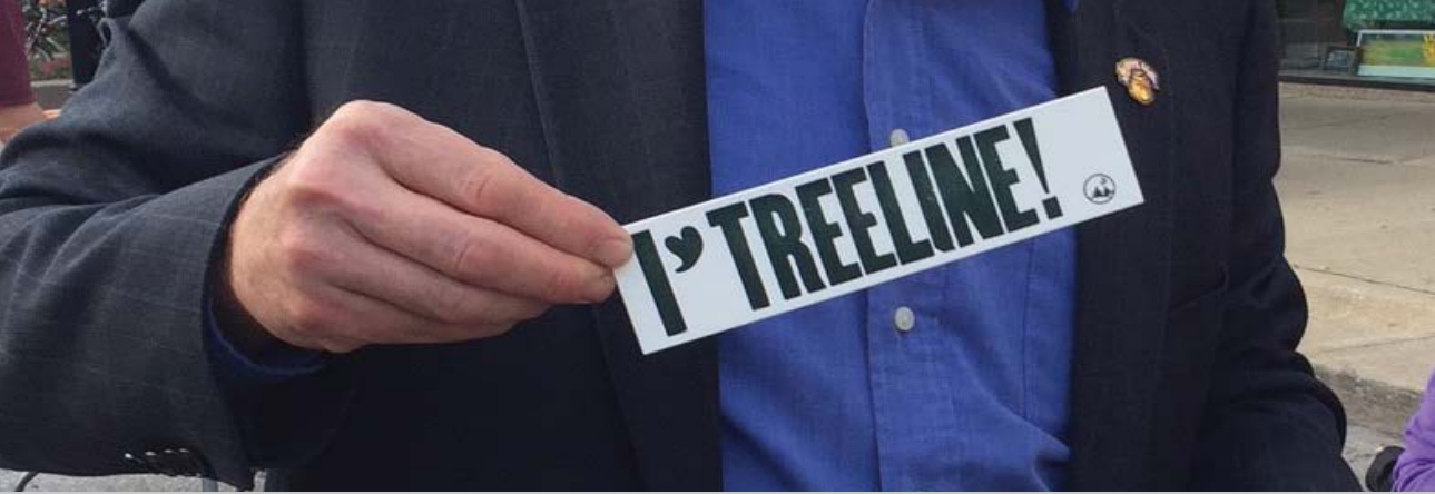
A Treeline bookmark from the Mayor’s Green Fair made on an antique letter press.

and Recreation Commission grant program that provides supplemental funding for the development of non-motorized trails. The funds provided to the Treeline are for the completion of an Alignment Study, which is a preliminary engineering study for the N. Main crossing, a significant trail link and the most difficult crossing.