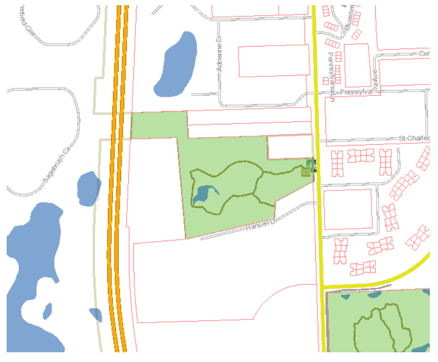
Figure 4 - Hansen Nature Area

With an addition of 1.5 acres donated by Avalon Nonprofit Housing Corporation as part of their Hickory Way apartments site plan, this nature area now has 9 acres. It is currently zoned R4B as is the adjacent Hickory Way site.