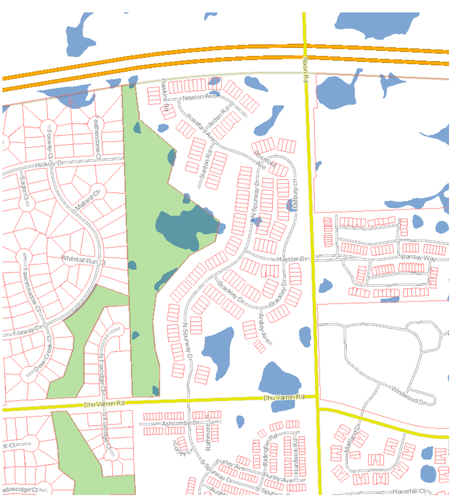
Figure 1 - Buttonbush Nature Area

The land is currently zoned R4A With Conditions, as is the adjacent North Oaks of Ann Arbor site.