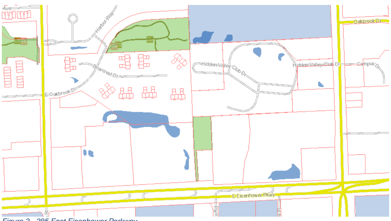
Figure 3 - 385 East Eisenhower Parkway

A 1.3-acre property was donated as part of the Malletts View Office Center development in 2007. The donated property is almost entirely covered by an easement to the Washtenaw County Drain Commissioner, now the Water Resources Commissioner. It is currently zoned PUD as is the adjacent Malletts View Office Center site.