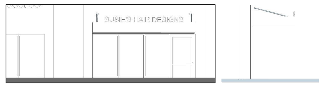
Example of Letters Above Projection (12" max.)

*Wall signs shall placed as follows: One- story building: Between the top of the ground floor windows and the bottom of the cornice or other element that defines the top of the building. Two- story building: Between the top of the ground floor windows and the bottom sill of the second-floor windows. Three stories or more: Same as two- story building or, alternatively, shall be placed above or alongside the upper floor windows below the bottom of the cornice or other element that defines the top of the building.