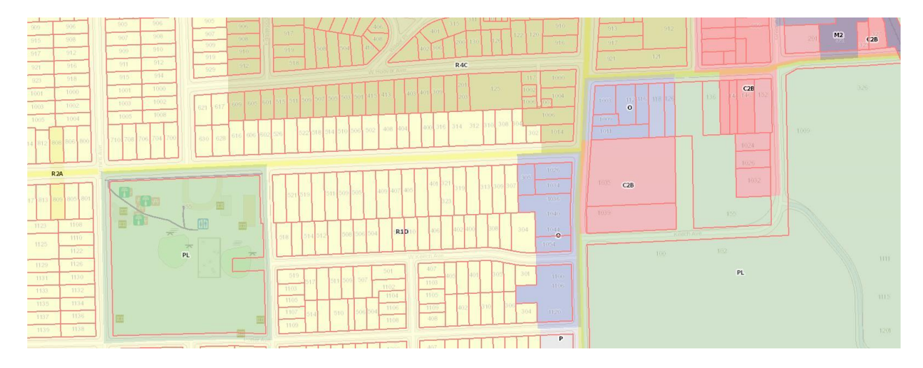
Figure 2 - Example of O district as buffer between major road and residential neighborhood (South Main, south of Pauline Blvd)