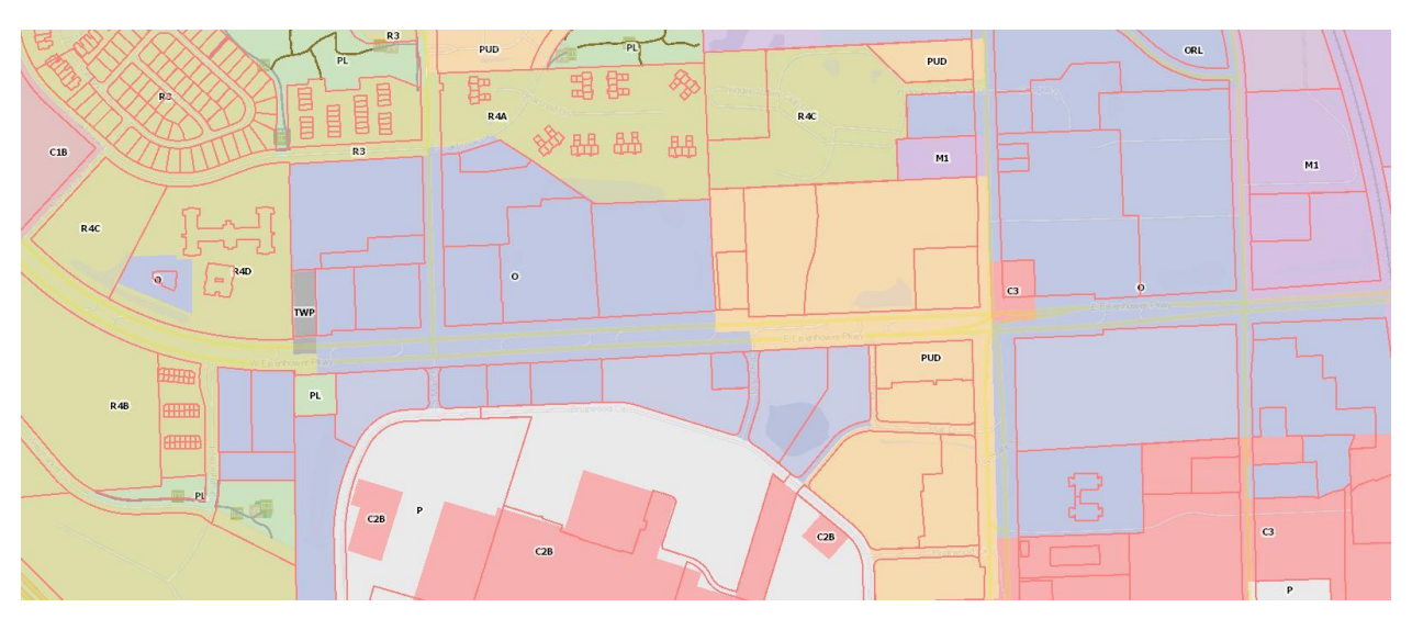
Figure 4 - Example of O district creating office complex (South Main Street at West Eisenhower Boulevard)