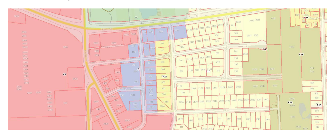
Figure 1 - Example of O district as buffer between commercial area and residential neighborhood (Collingwood Dr between Jackson and Fair St)