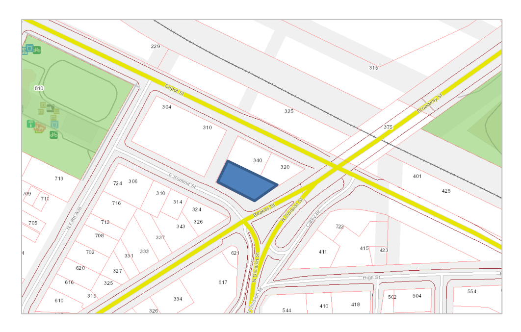
The Garnet Zoning and Site Plan Staff Report Page 2