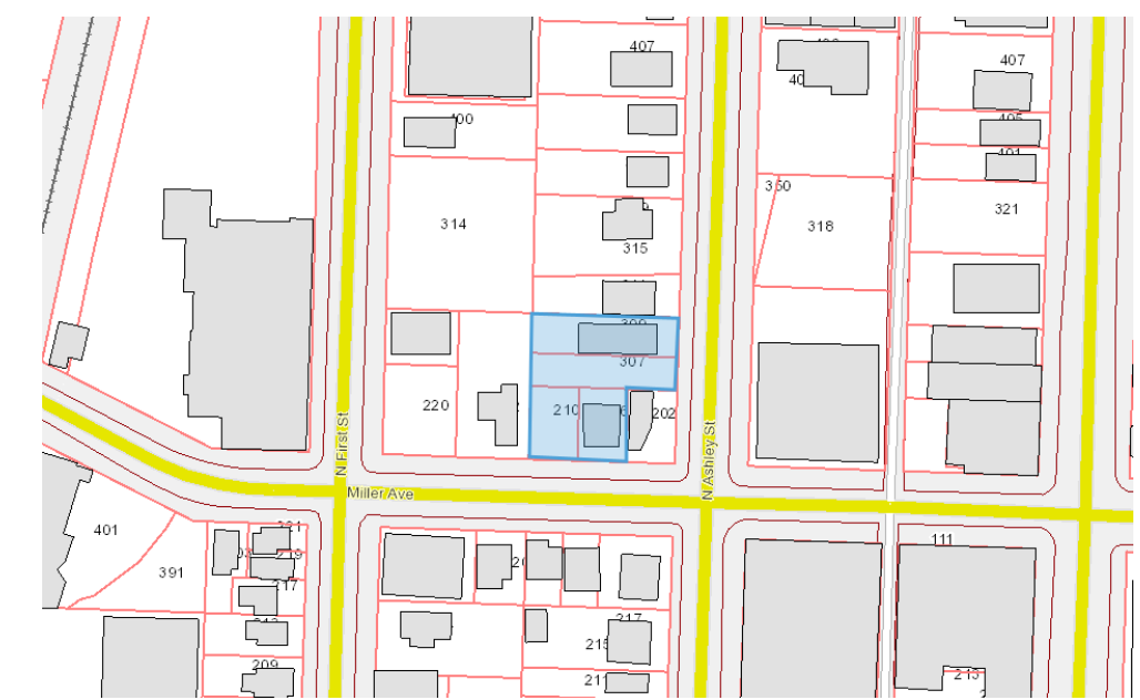
Figure 1 - Location Map

This site is located on northwest of the Miller Avenue and North Ashley Street intersection. It is in the Downtown Development Authority district.