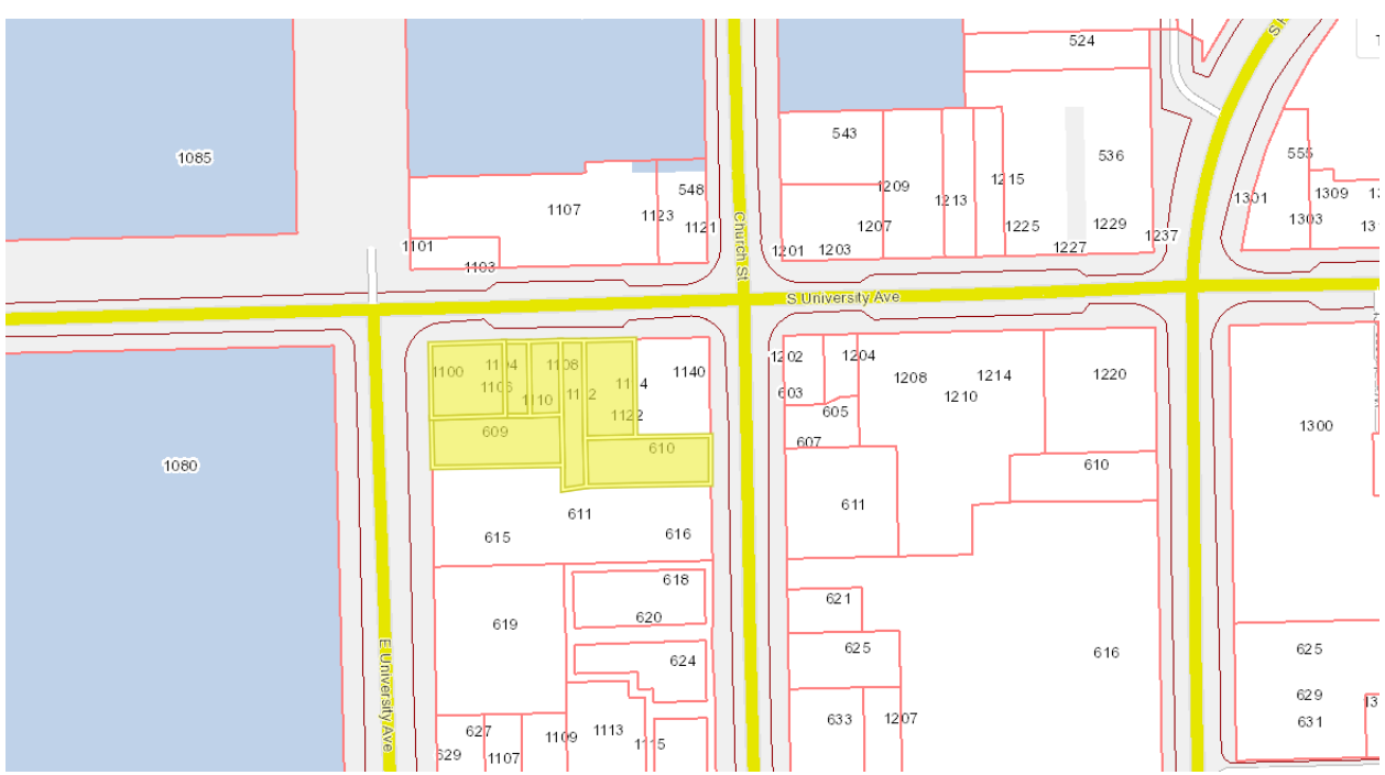
Figure 1 - Site Location

Hobbs + Black Architects – Tom Dillenbeck Midwestern Consulting (Engineer) – Tom Covert