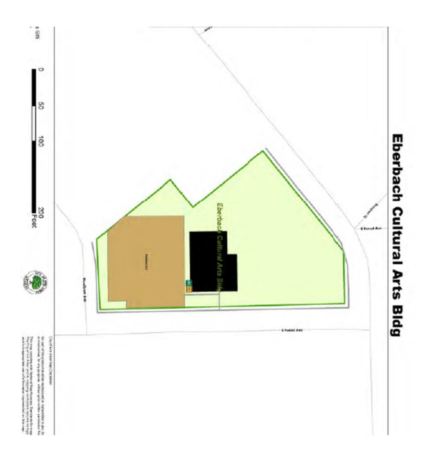
Exhibit C Diagram of Premises