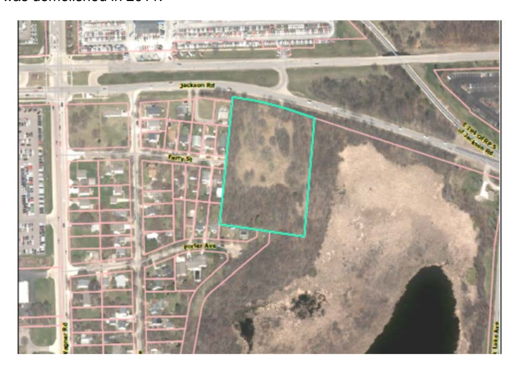
Figure 1: Existing Conditions (2015)

<u>Existing Conditions</u> – The site is currently vacant, one single-family home occupied the site and was demolished in 2011.