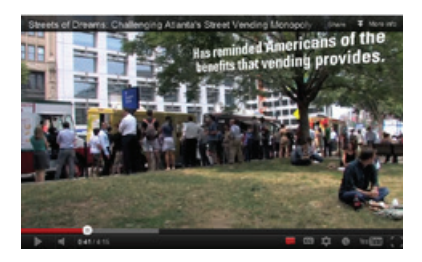
Atlanta Vending www.ij.org/freedomflix/category/51/177