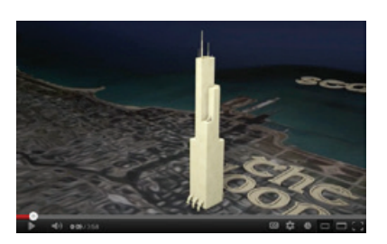
Chicago Food Trucks www.ij.org/ChicagoFoodTruckVideo

Seven Myths and Realities about Food Trucks: Why the Facts Support Food-Truck Freedom (November 2012) <u>http://www.ij.org/vending</u>