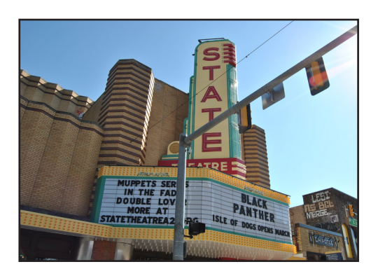
Name: State Theater Renovation Occupancy: A-1 Assembly Theater Location: Ann Arbor, MI