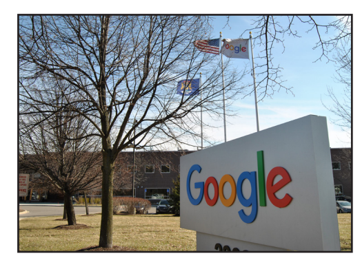
Name: Google Headquarters Occupancy: B-Business Location: Ann Arbor, MI