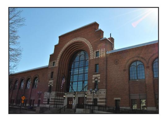
Name: IM Building Renovation Occupancy: A-2 Recreational Location: U of M Campus Ann Arbor