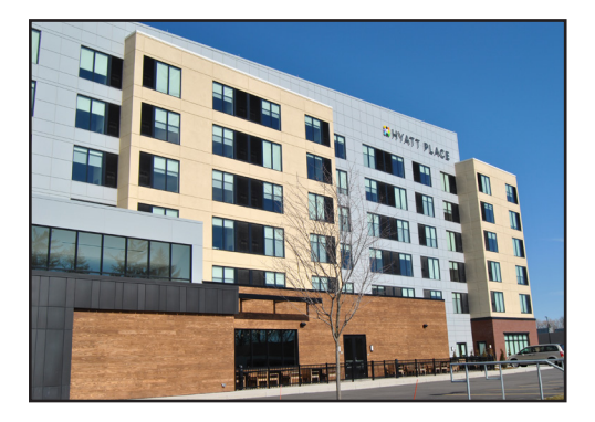
Name: Hyatt Place Occupancy: R-1 (Hotel) Location: Ann Arbor, MI