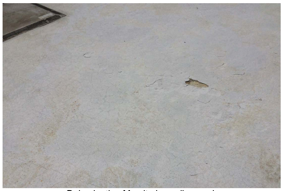
Delaminating Marcite in wading pool