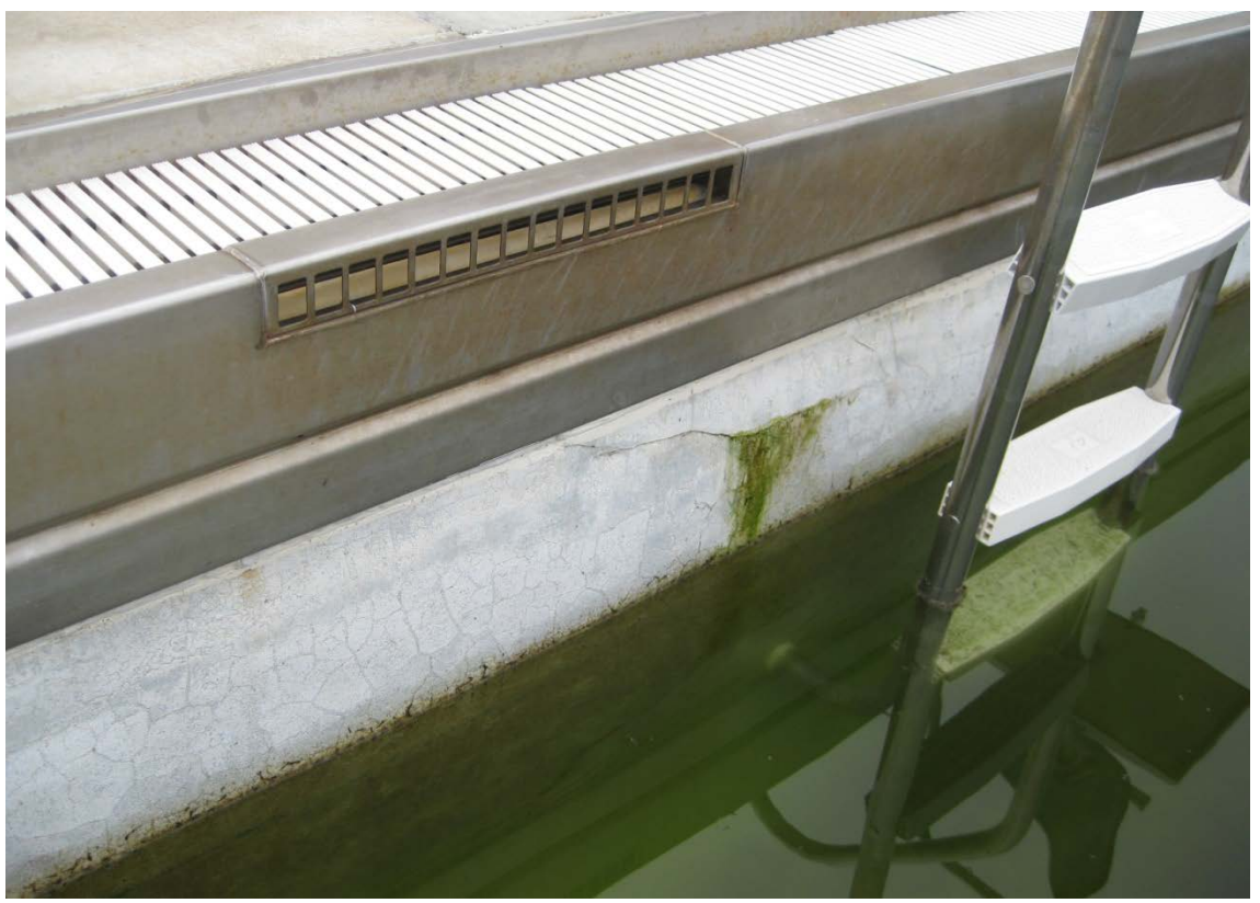
Condition of Marcite in deep pool