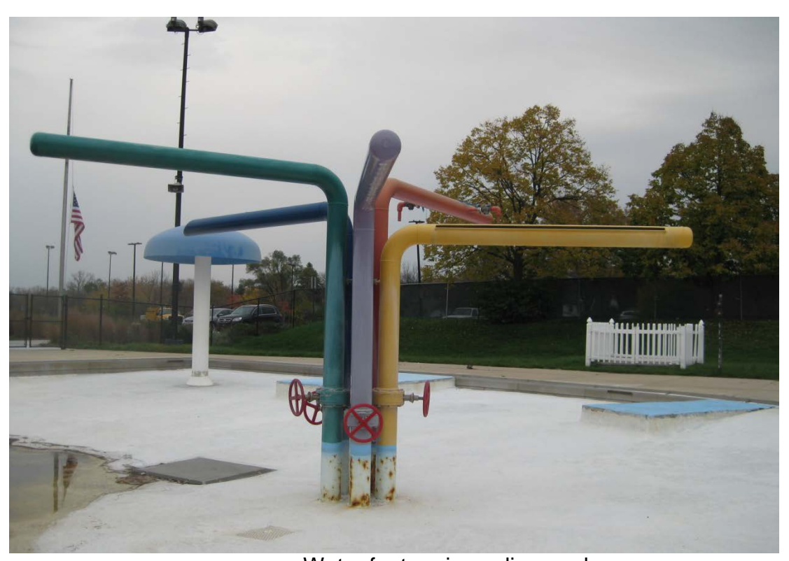
Water feature in wading pool