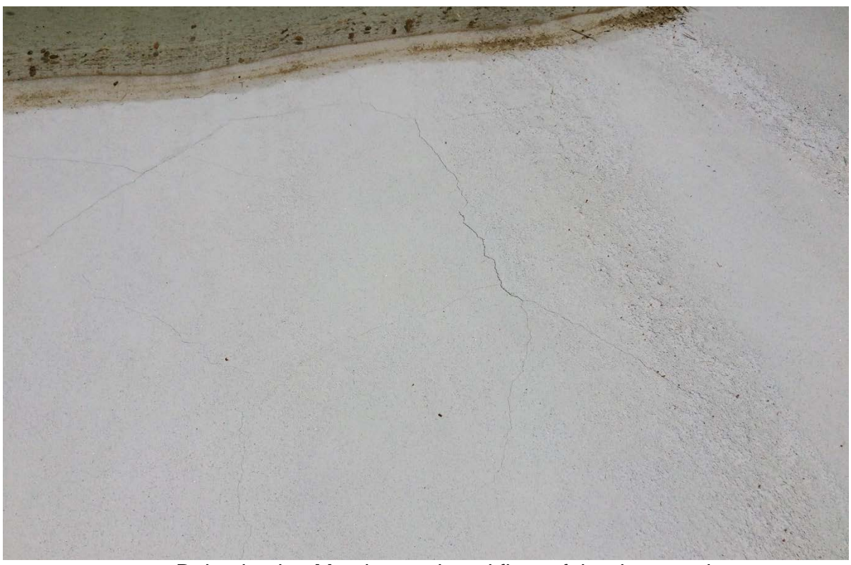
Delaminating Marcite on sloped floor of the deep pool