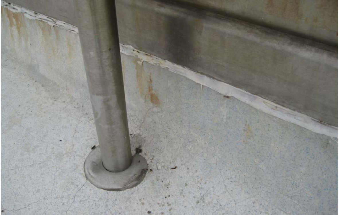
Install base cones on handrail system