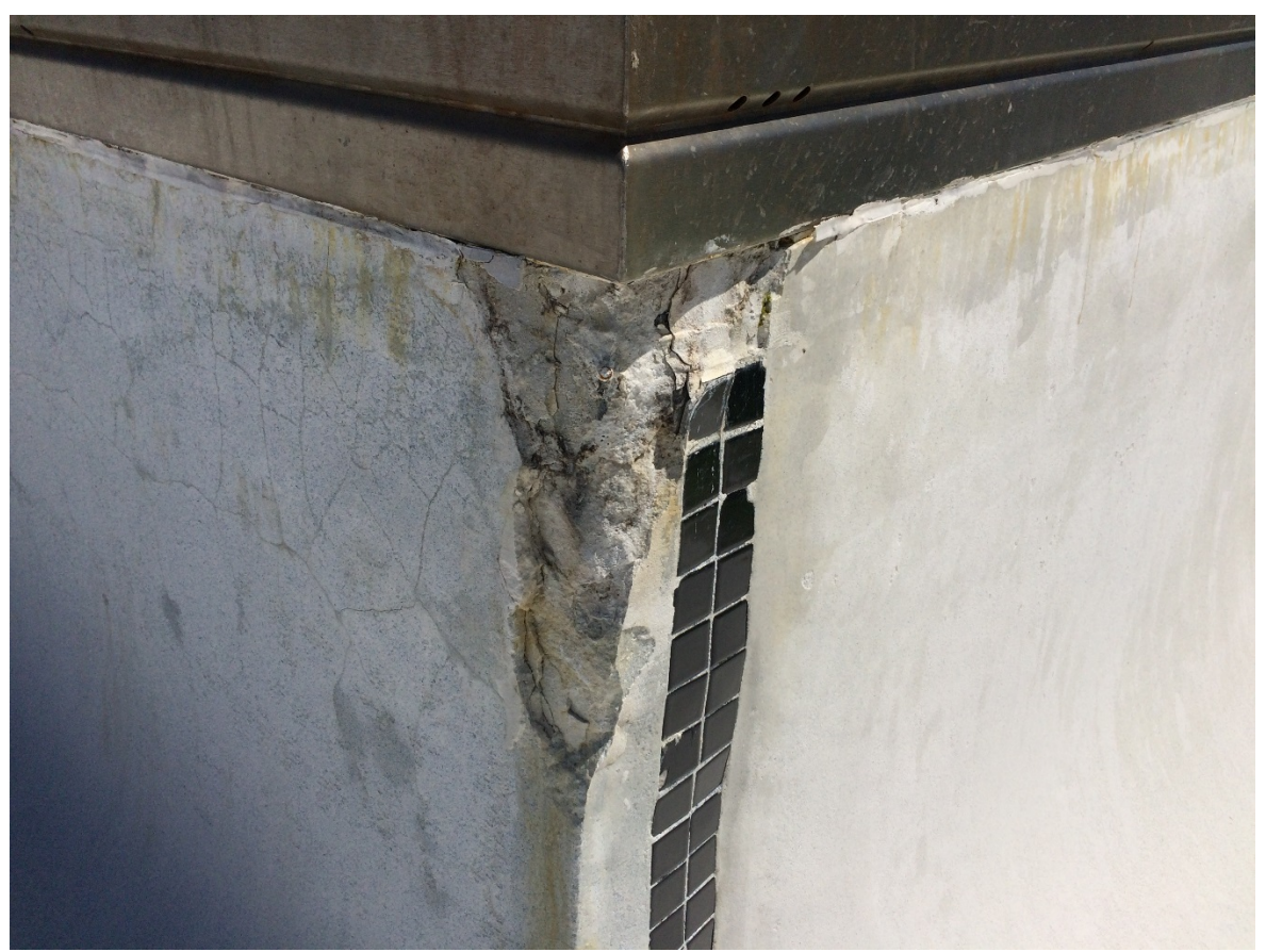
Spalling concrete on NE corner of deep pool