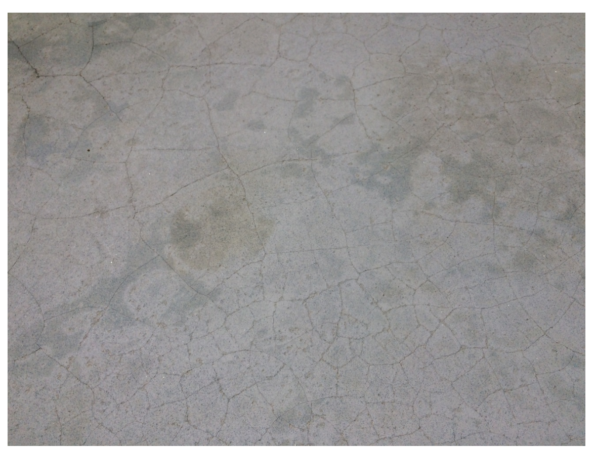
Delaminating Marcite in wading pool