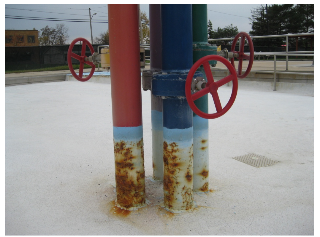
Base condition of water feature in wading pool