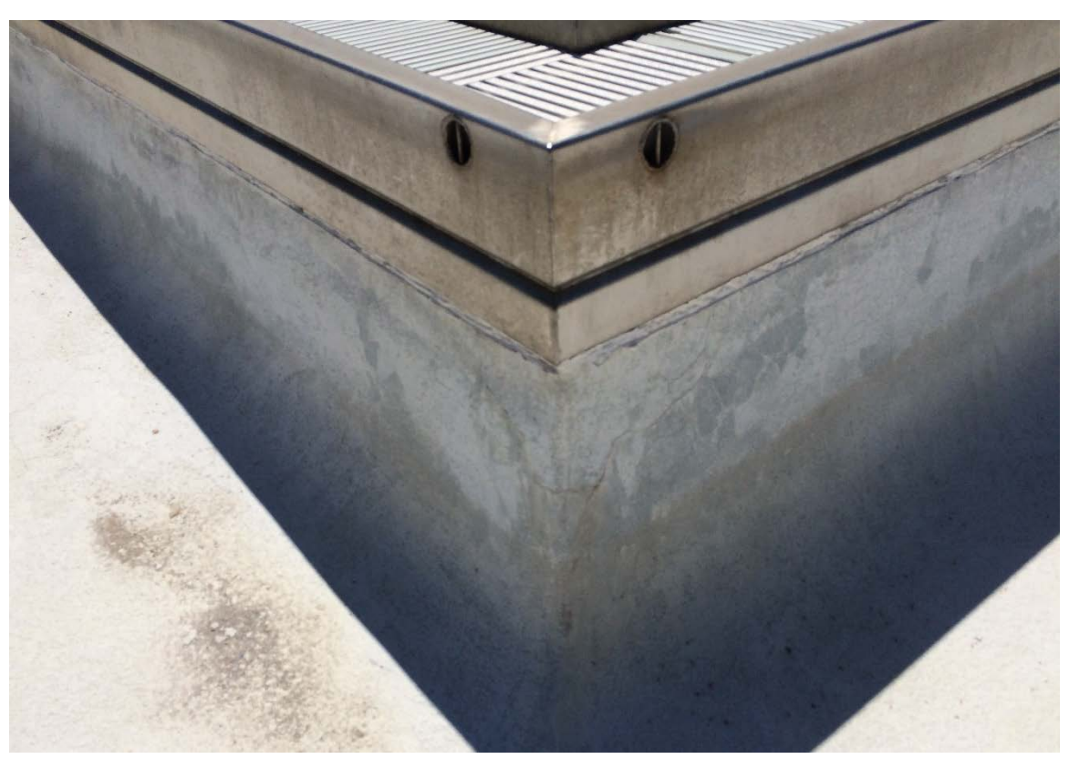
Delaminating Marcite in NW corner of wading pool