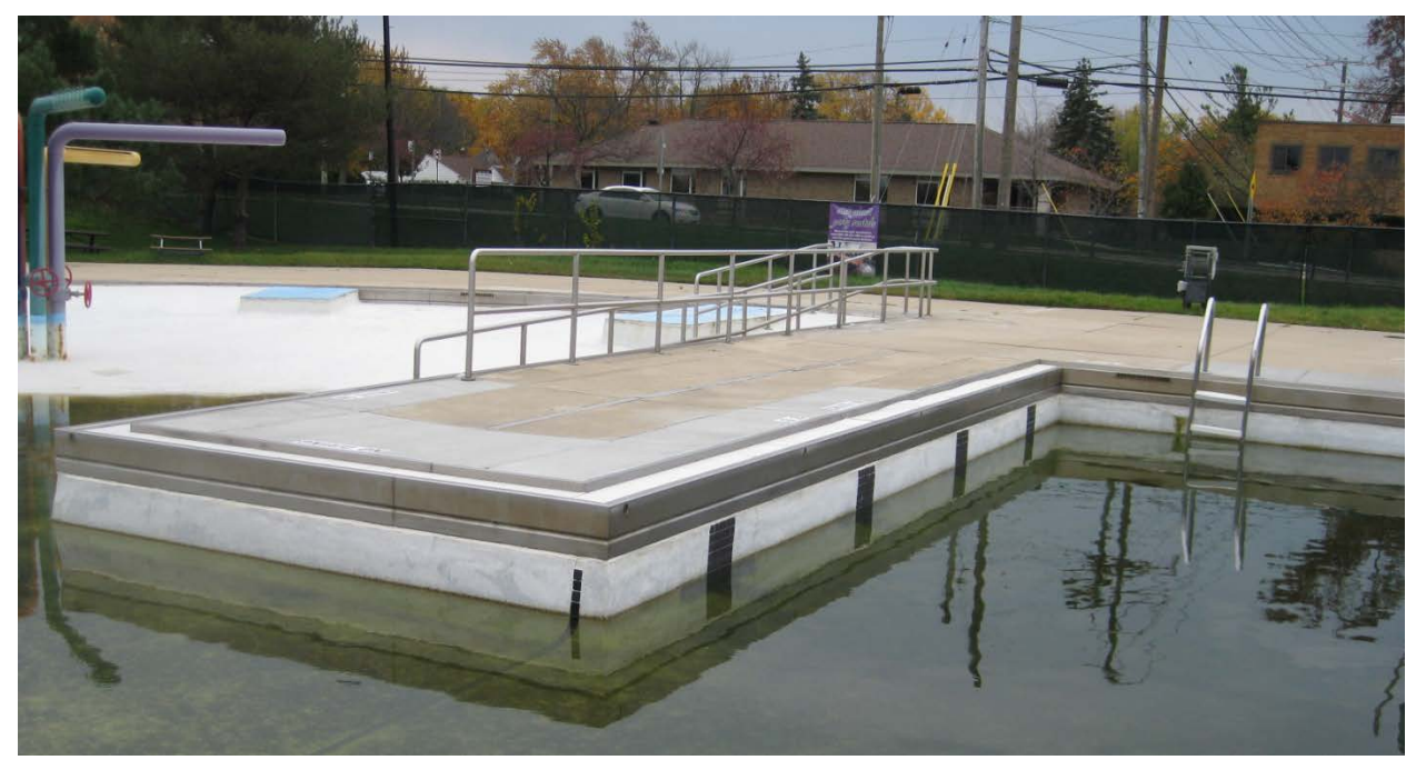
Area between wading pool and lap pool