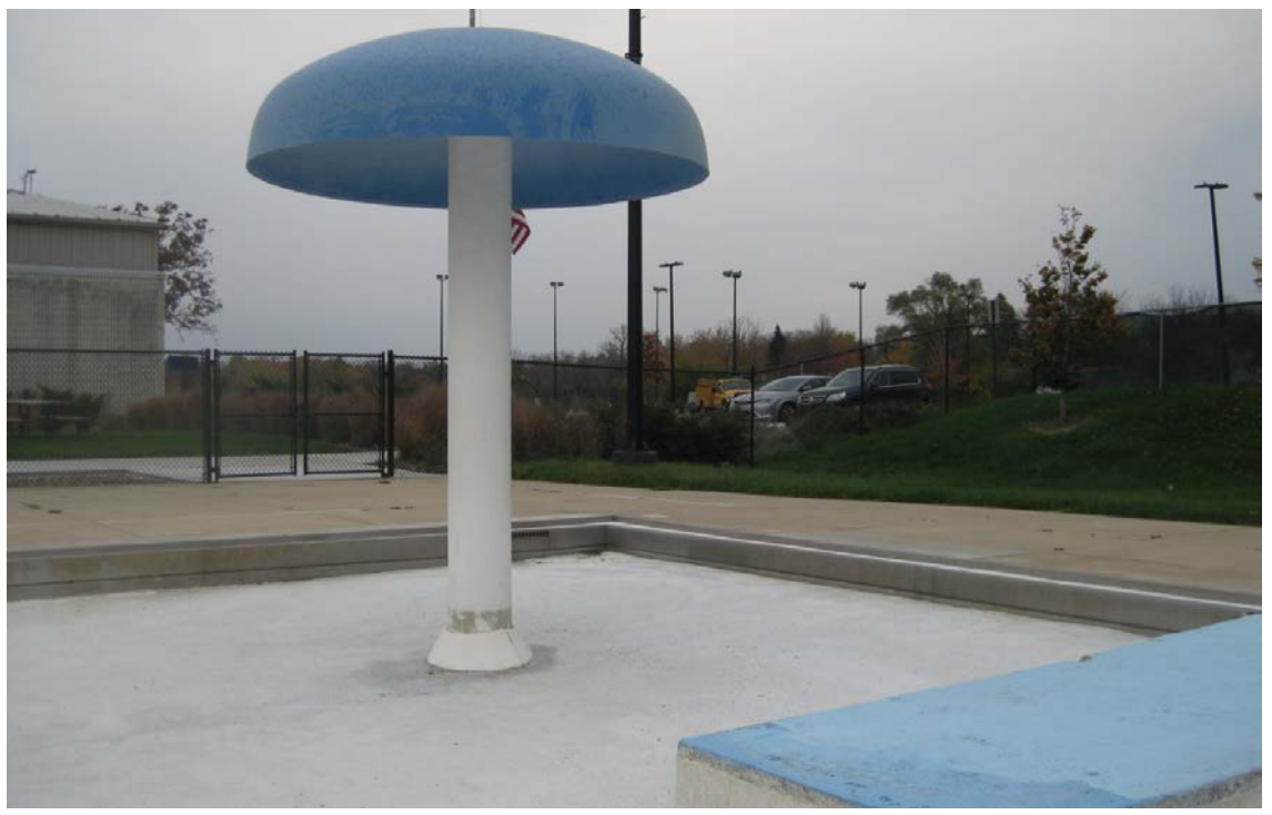
Water feature in wading pool