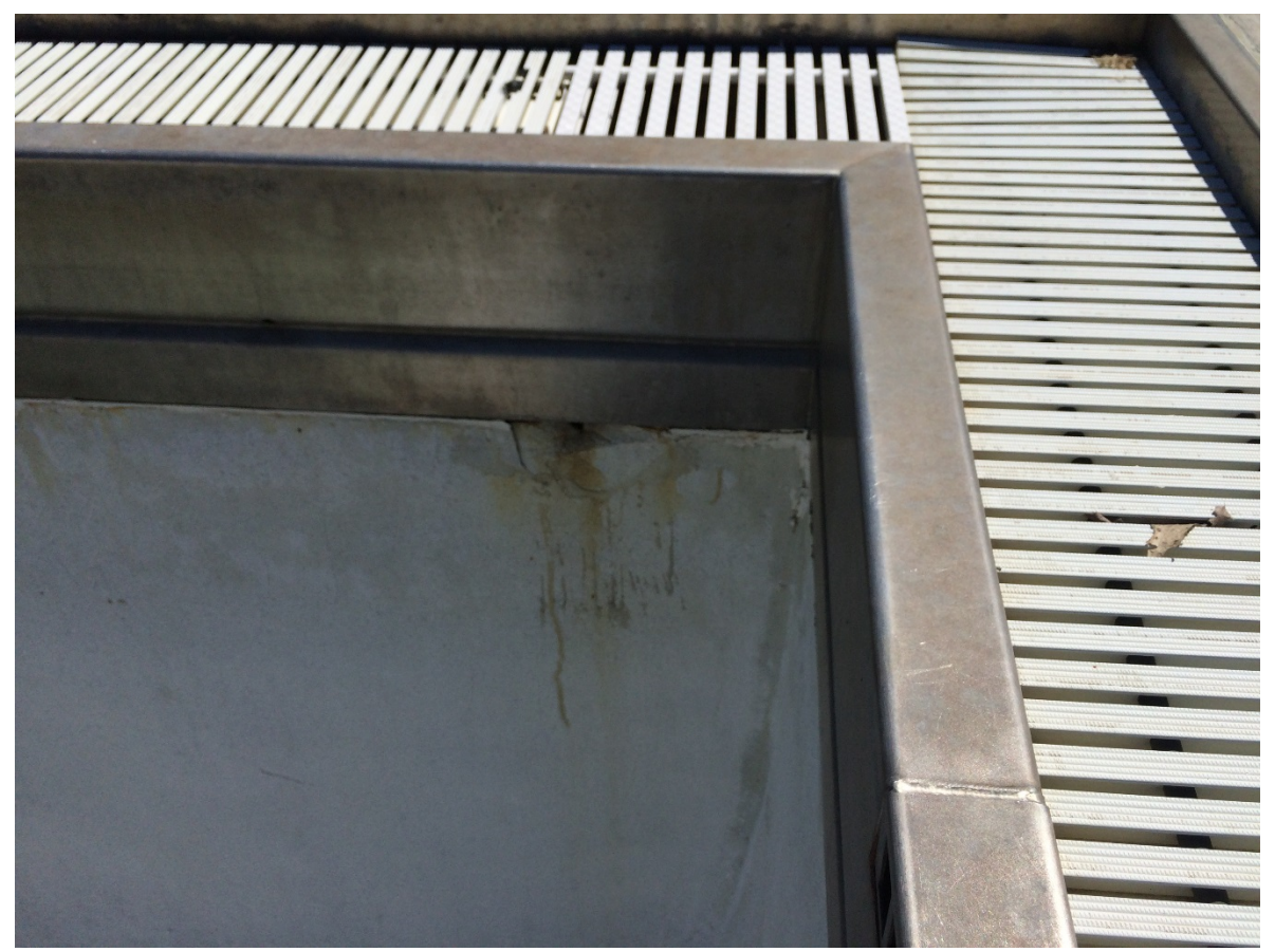
Spalling concrete beneath stainless steel gutter SW corner of deep pool