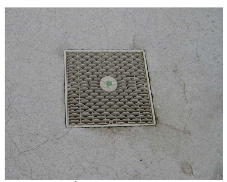
Grate in wading pool