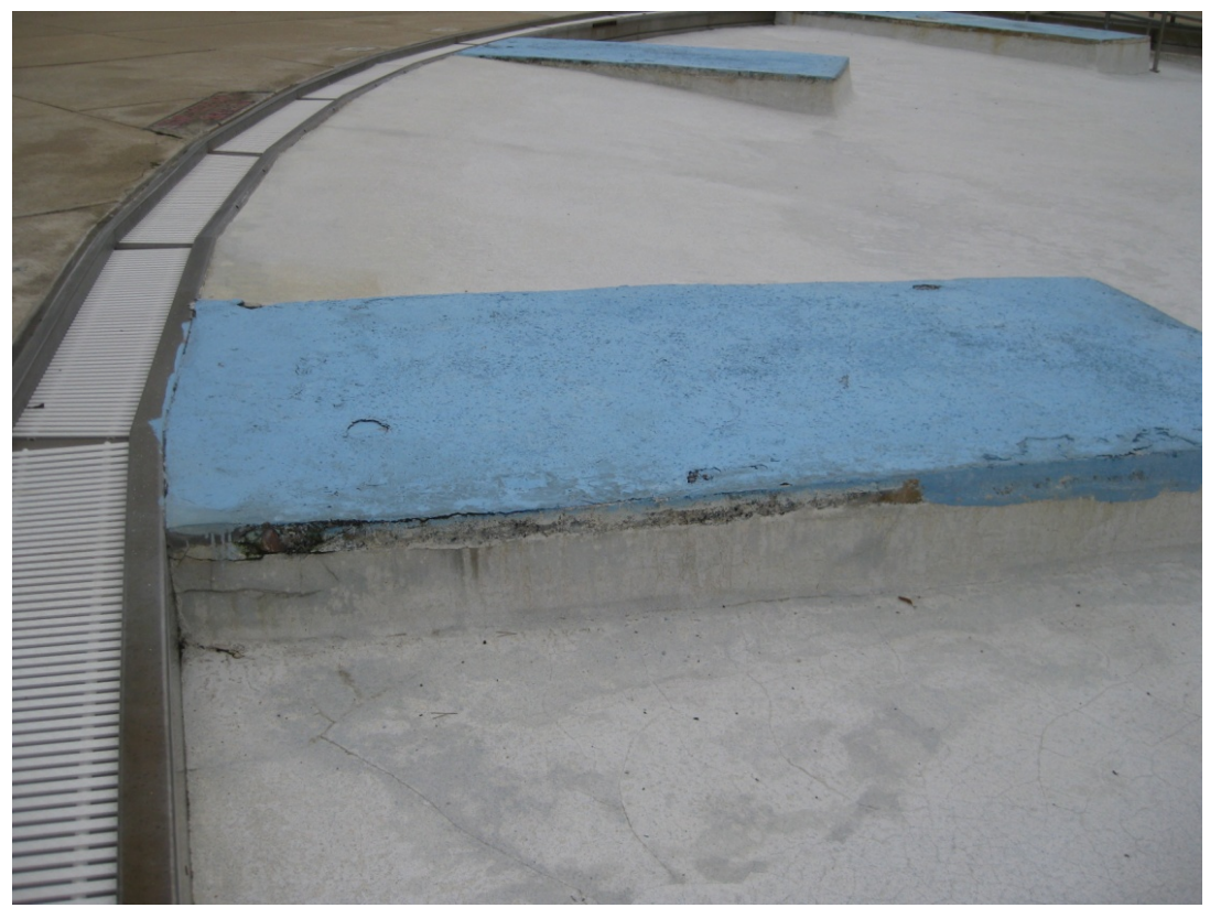
Concrete pads in wading pool