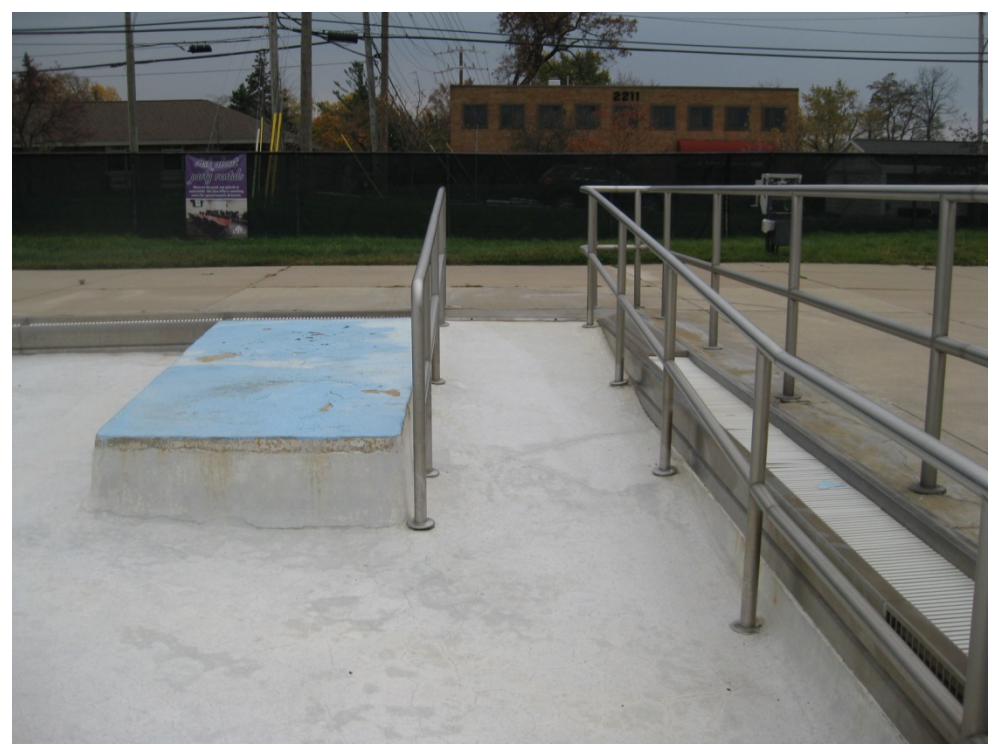
Ramp entering wading pool