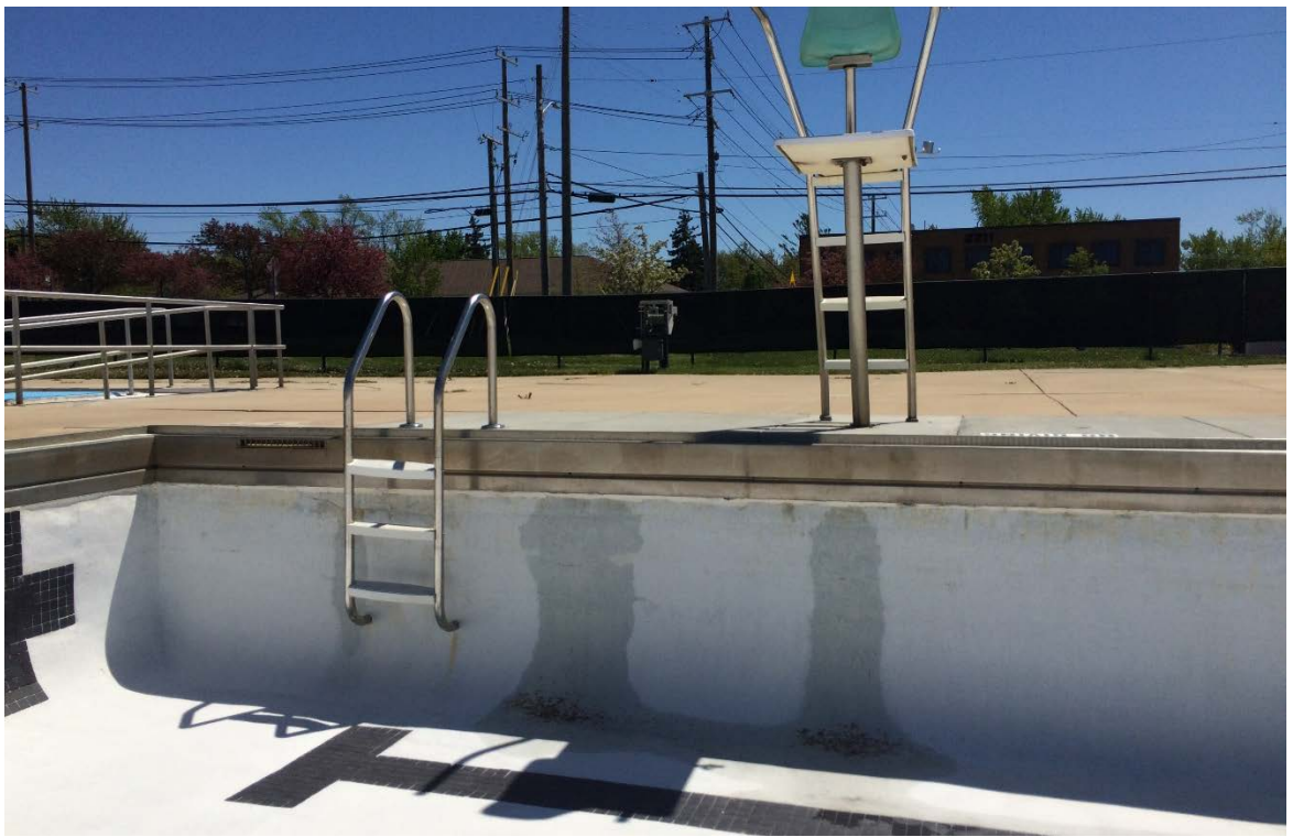
Leaking stainless steel gutter south wall east of deep pool