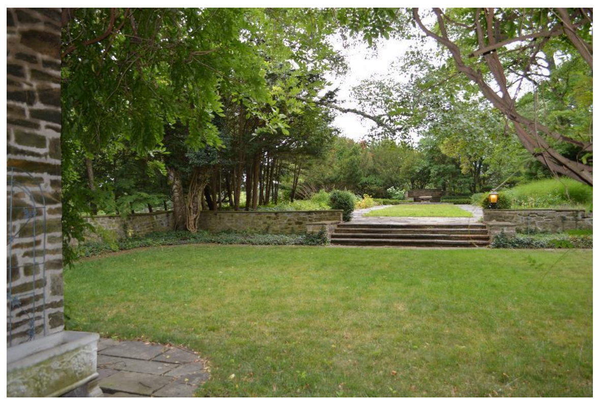
Looking south at south lawn panel and formal garden, July 2017