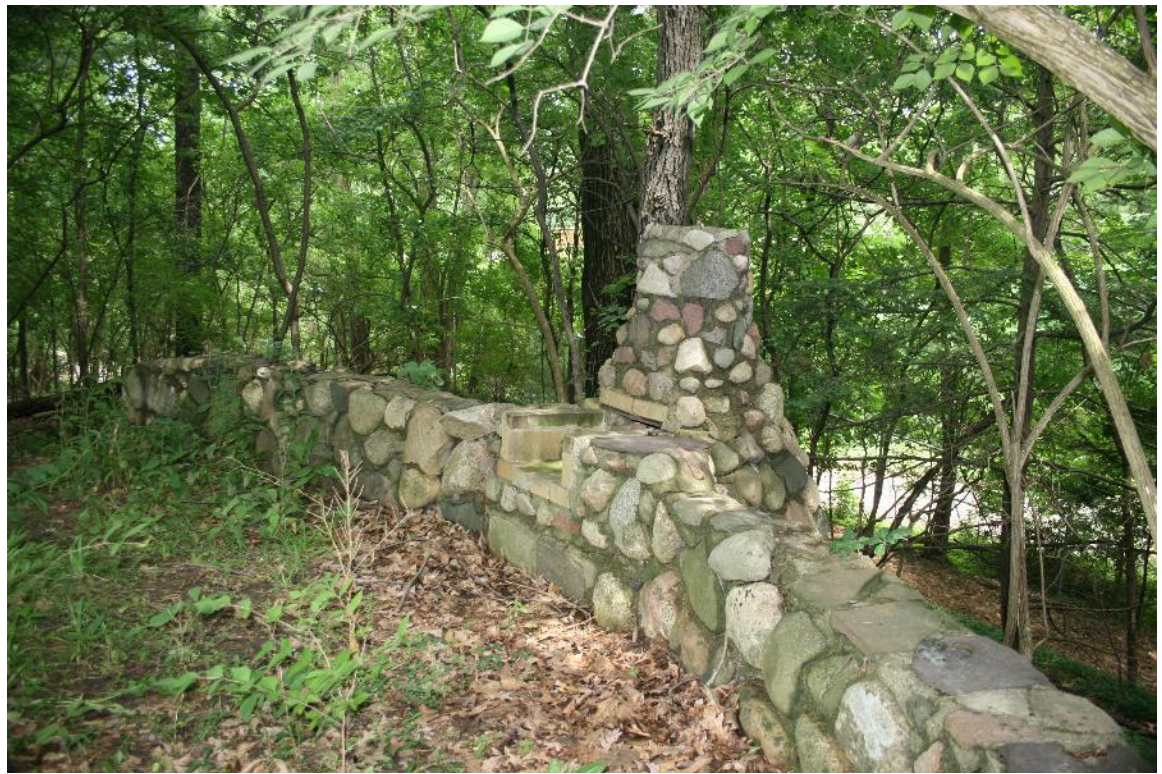
Fireplace built into east wall of wild garden, July 2017