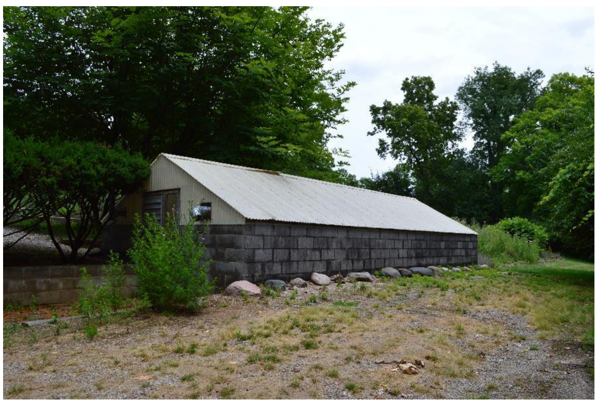
Looking northeast at coldhouse, July 2017