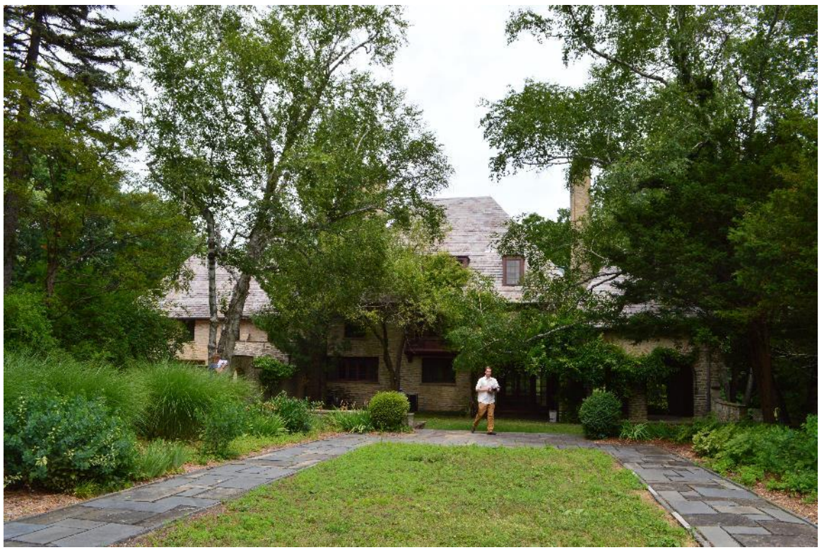
Looking north in formal garden to rear of Inglis House, July 2017