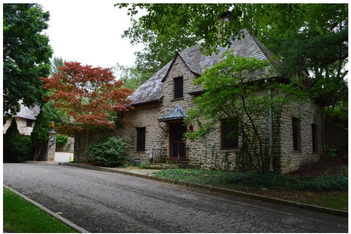
Looking northeast at caretaker's cottage with house to left, July 2017