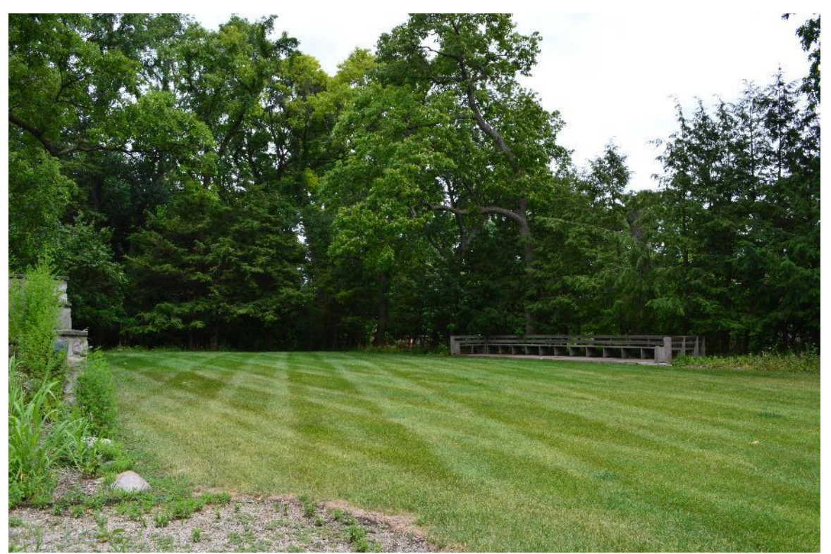
Looking northeast at tennis lawn, July 2017