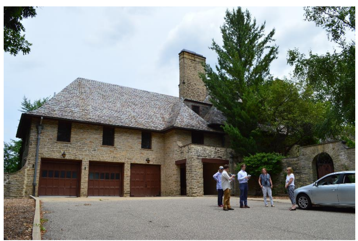
Looking northeast at rear of Inglis House and Interior Parking Court, July 2017