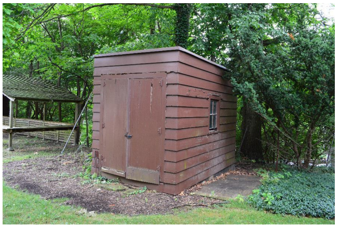
Looking southeast at peacock house/drying shed, July 2017