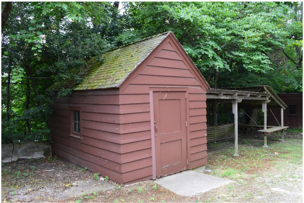
Looking southwest at garden shed and lath house, July 2017