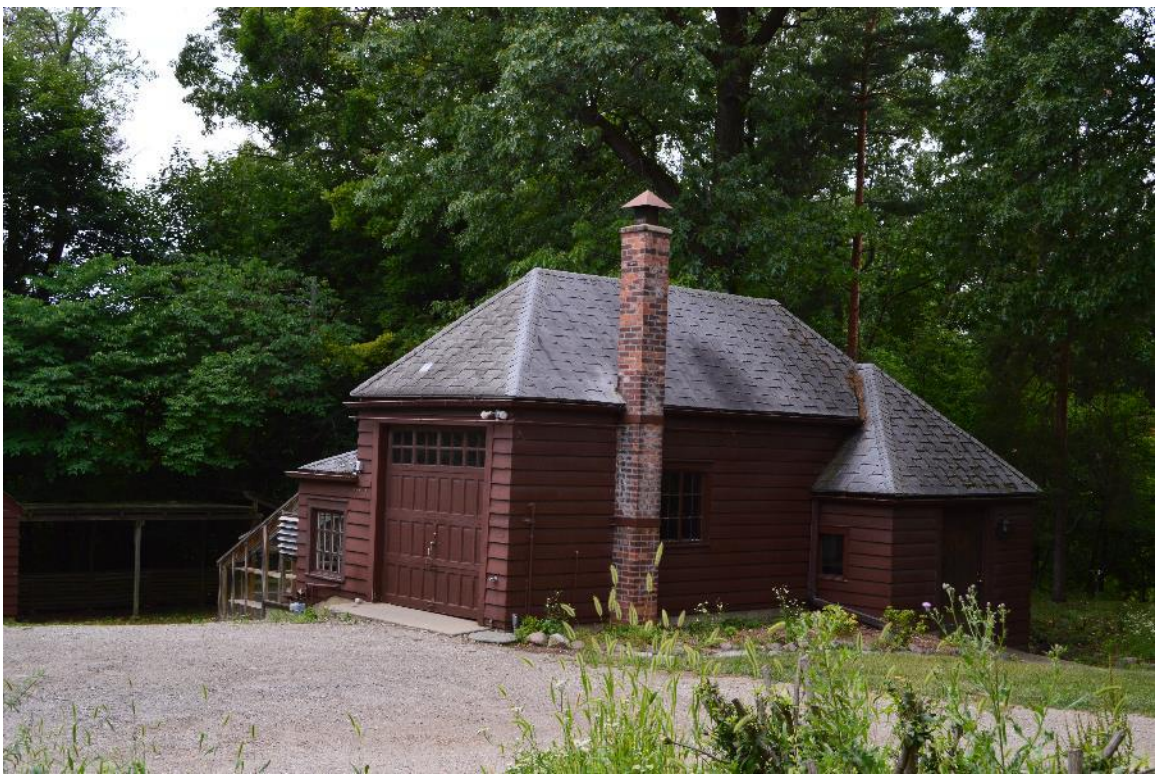
Looking southwest at shop and greenhouse, July 2017