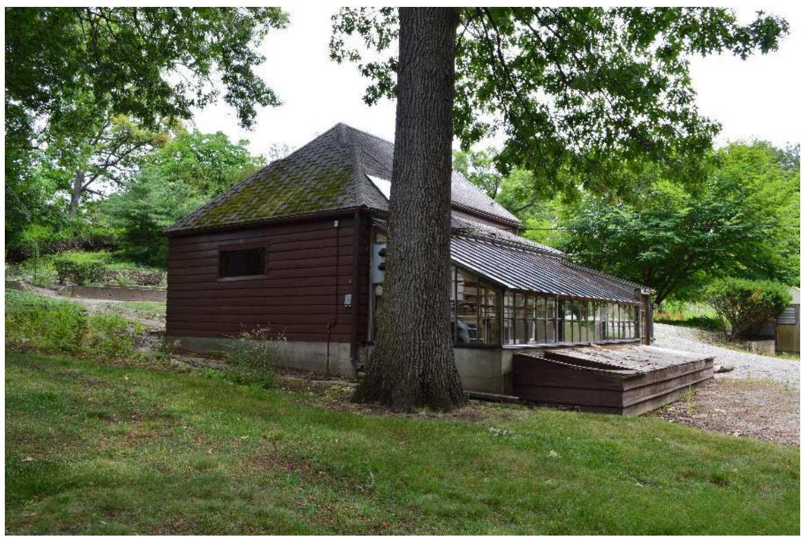
Looking northeast at shop and greenhouse, July 2017