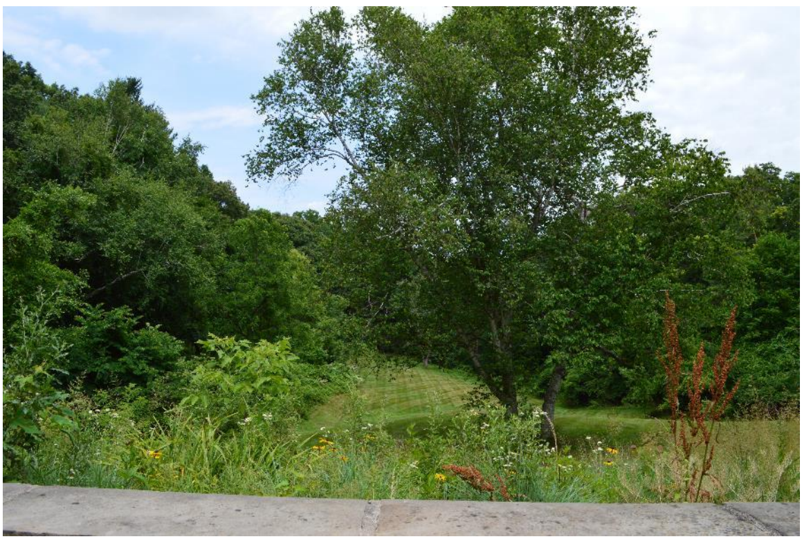
Looking north from oval arrival court out to north lawn, July 2017