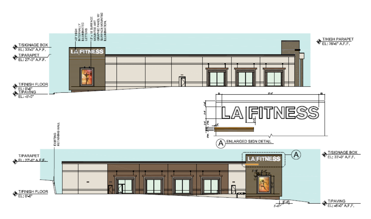
Figure 1 - North and East Elevations