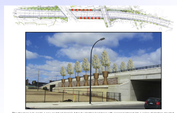
The idea here is to create a new sculptural Annie's Arbor by planting local trees with seasonal interest into a series of planters elevated