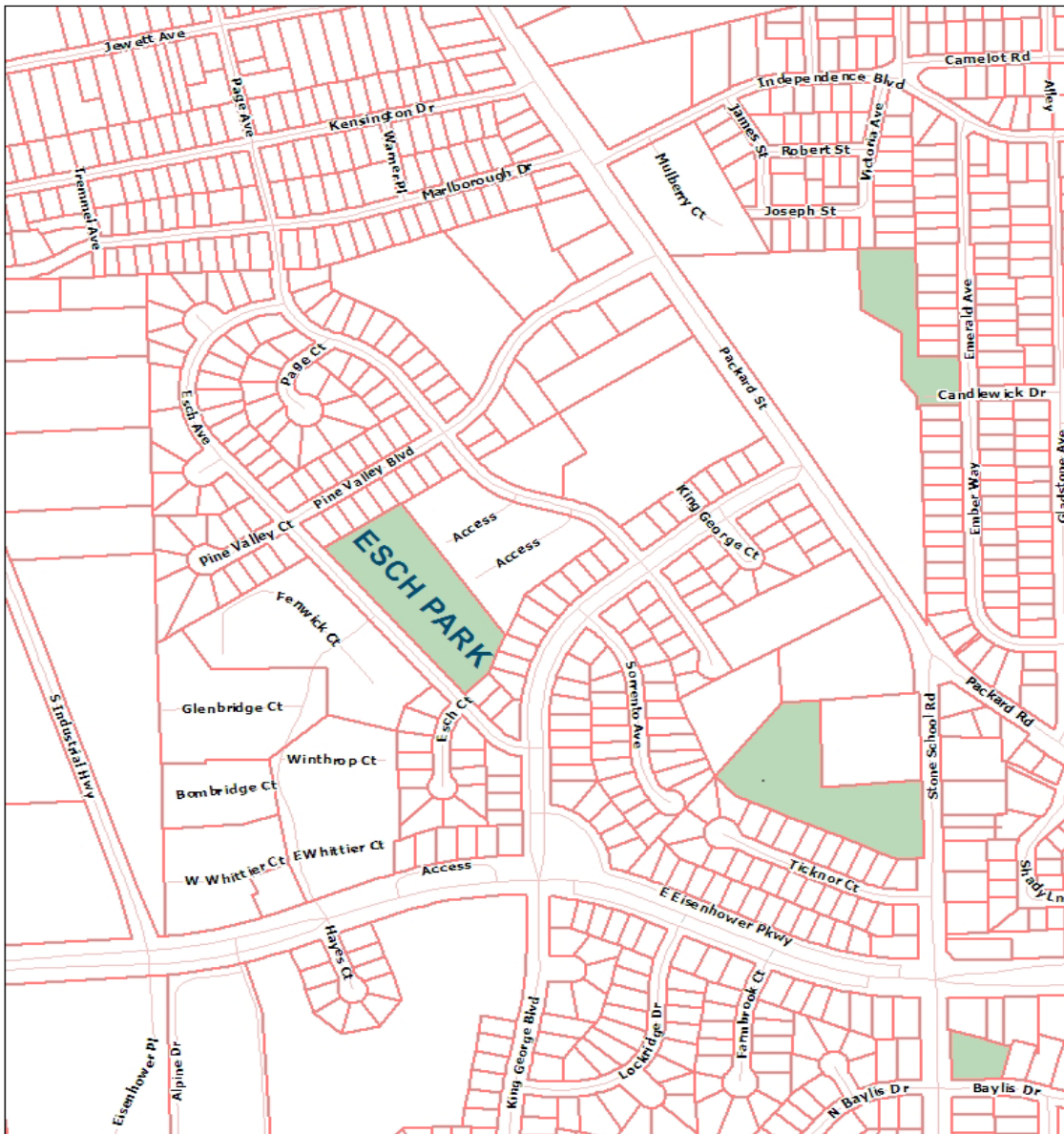
Esch Park Location Map

Attendance at this conference is optional, but highly recommended. Administrative and technical questions regarding this project will be answered at this time. The pre-bid meeting is for information only. Any answers furnished will not be official until verified in writing by the Financial Service Area, Procurement Unit. Answers that change or substantially clarify the bid will be affirmed in an addendum.