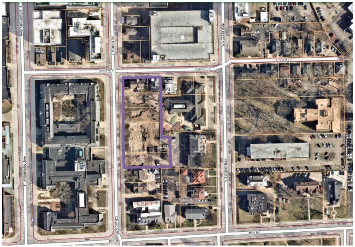
Figure 2: Existing Conditions (2023 Aerial Photo)

The 46,302-square foot site is zoned R4C (Multiple-Family Dwelling) and consists of six lots in the block bounded by Willard Street on the north, South Forest Avenue on the east, Hill Street on the south, and Church Street on the west. Most buildings on the site have recently been demolished.