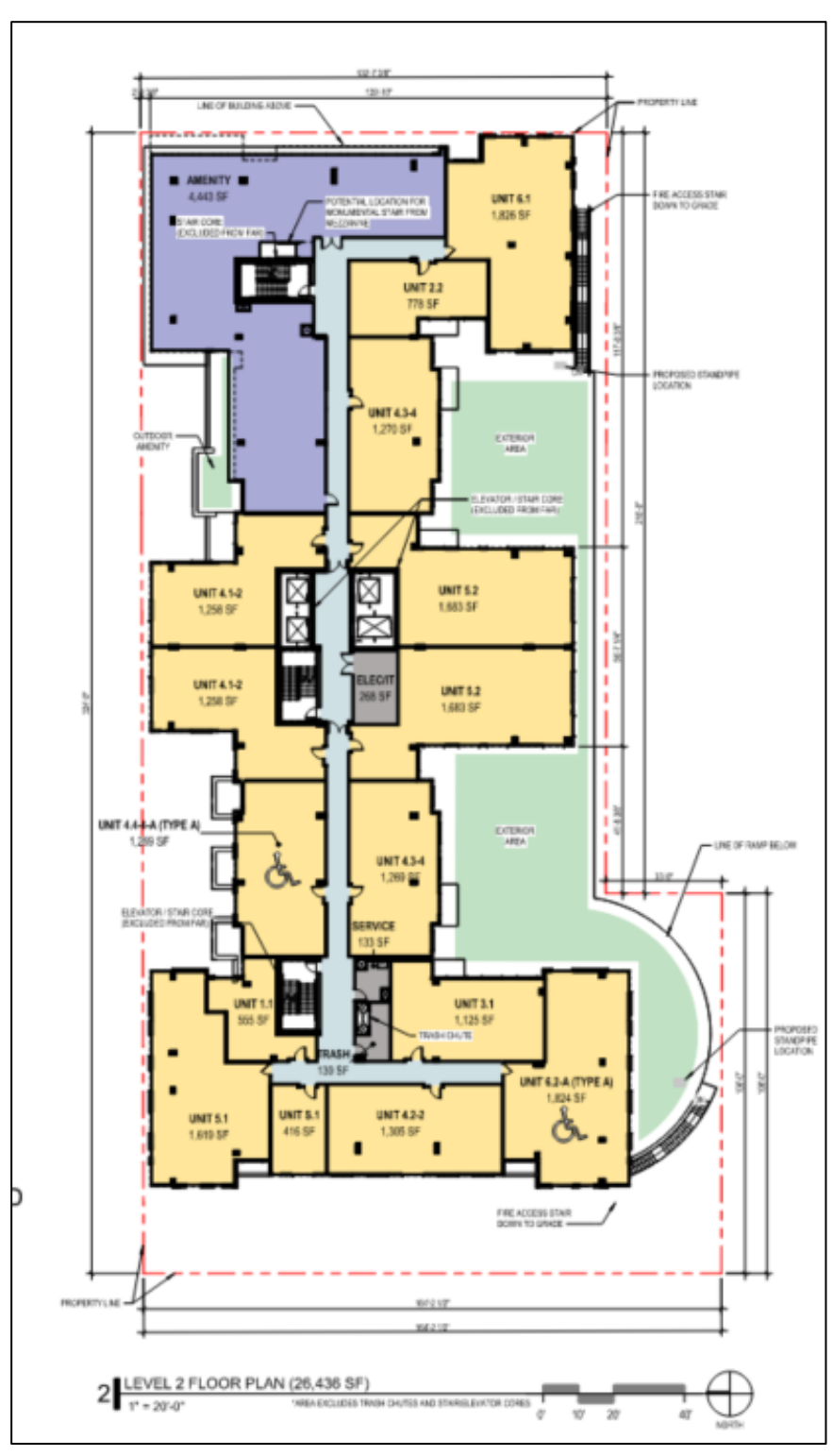
Figure 4: Proposed level 2 floor plan. Base includes green shading (depicting open space on top of base). Tower includes only purple (amenity space) and yellow shading (apartment units). Red dashed line illustrates site boundary.