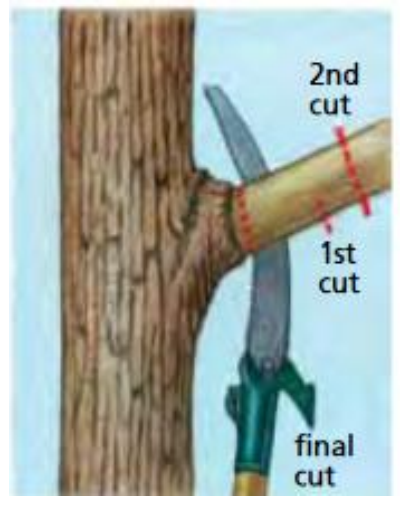
Figure B: Tri-cut method. Source: "How to Prune Trees," USDA Forest Service

Figure A: Branch bark ridge & branch bark collar diagram. Source: "How to Prune Trees," USDA Forest Service