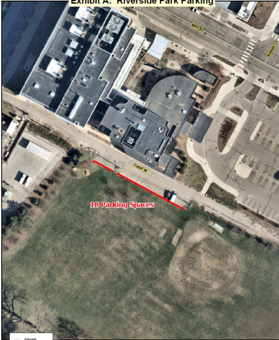
Exhibit A: Riverside Park Parking