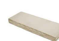
LEDGESTONE COPING (BUFF)