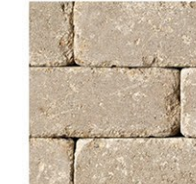
UNILOCK BRUSSELS DIMENSIONAL WALL (SANDSTONE)