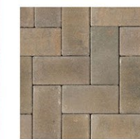
HOLLAND PREMIER (RIVER)