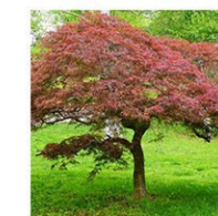
DWARF JAPANESE MAPLE