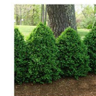
GREEN MOUNTAIN BOXWOOD