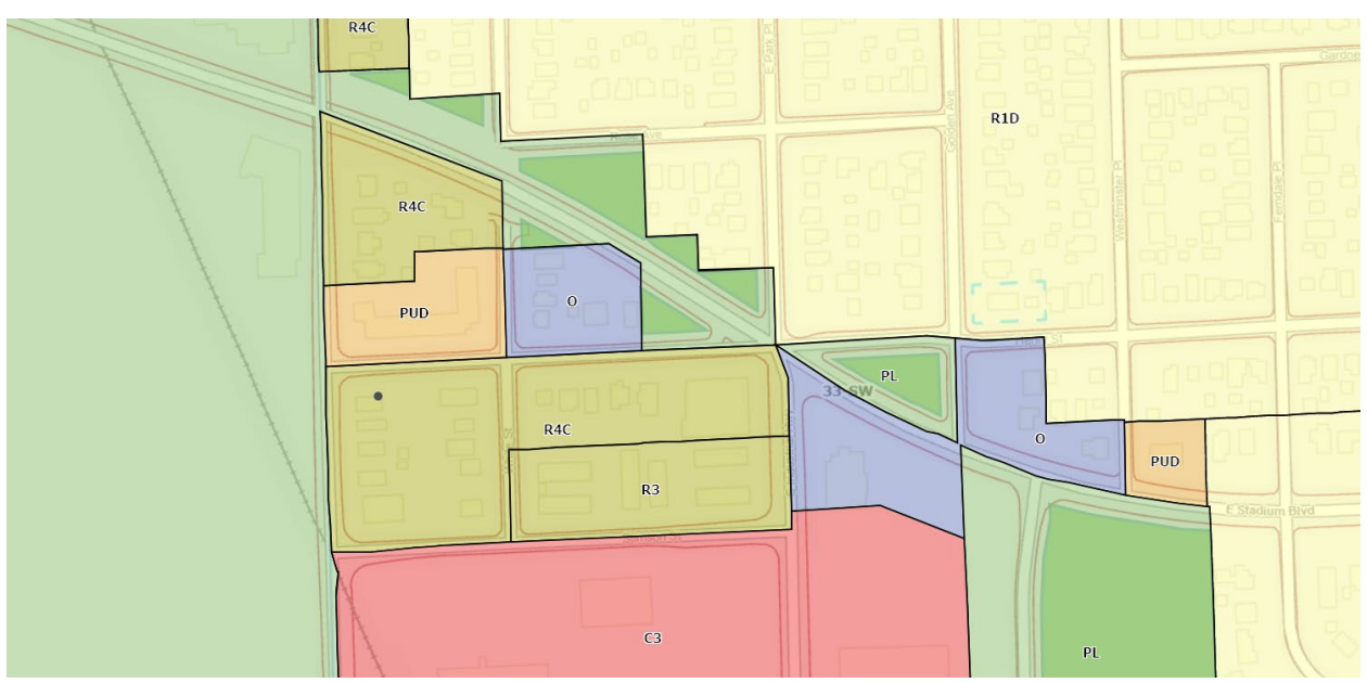
Figure 3: Current Zoning Map

<u>Current Zoning</u> – The lots that make up the South Town site are currently zoned R4C (Multiple-Family Dwelling). This district has a minimum lot size of 8,500-square feet. Conforming lots in this district can have multiple-family dwellings at a density of 10 dwelling units per acre. Nonconforming lots in the R4C district may be developed with a single-family dwelling. Any dwelling in the R4C district may have up to 6 unrelated persons in each household.