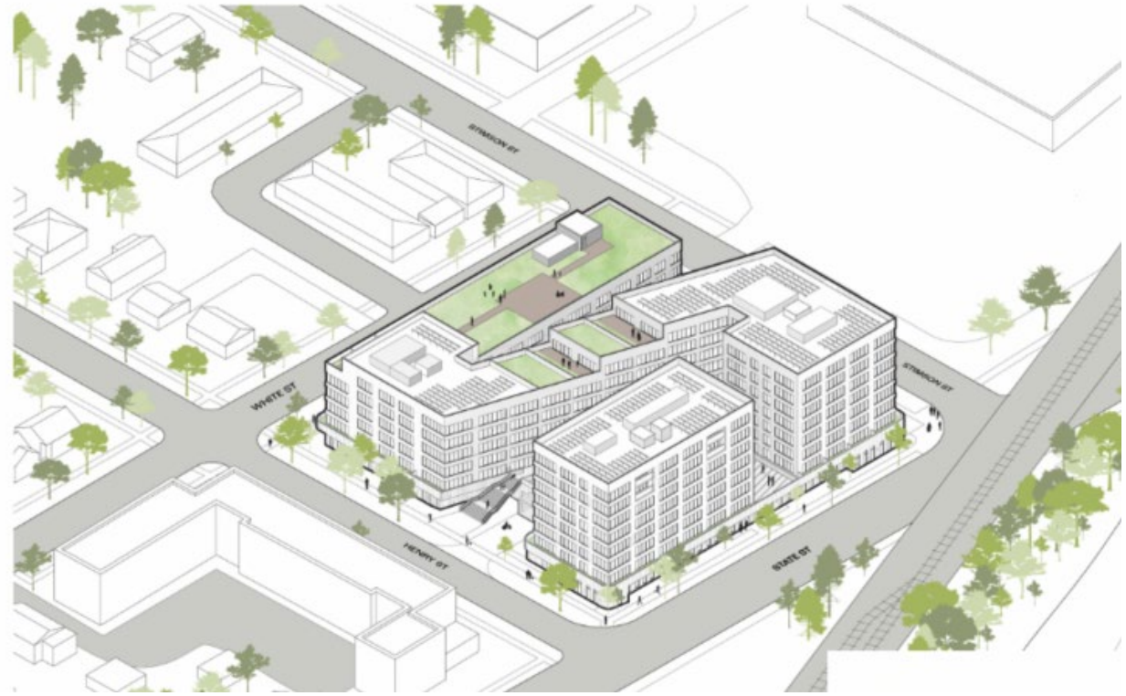
Figure 6 – Axonometric Site Layout (Henry/South State corner looking SE)