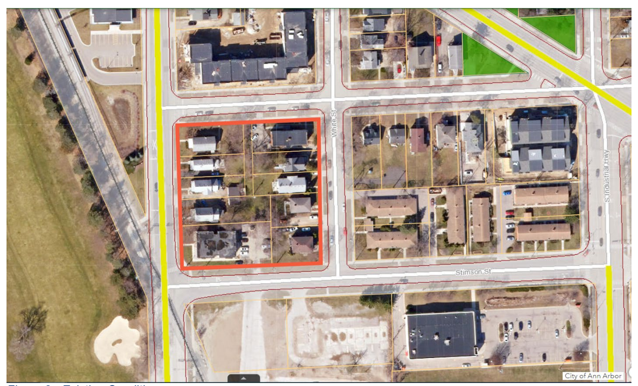
Figure 2 - Existing Conditions

The northern half of the site is part of Block 3 of the 1890 Hamilton, Rose and Sheehan's Addition to the City and Town of Ann Arbor. The southern half are Lots 1, 2, 3 and 4 of the 1924 Stimpson Subdivision of Ann Arbor Township.