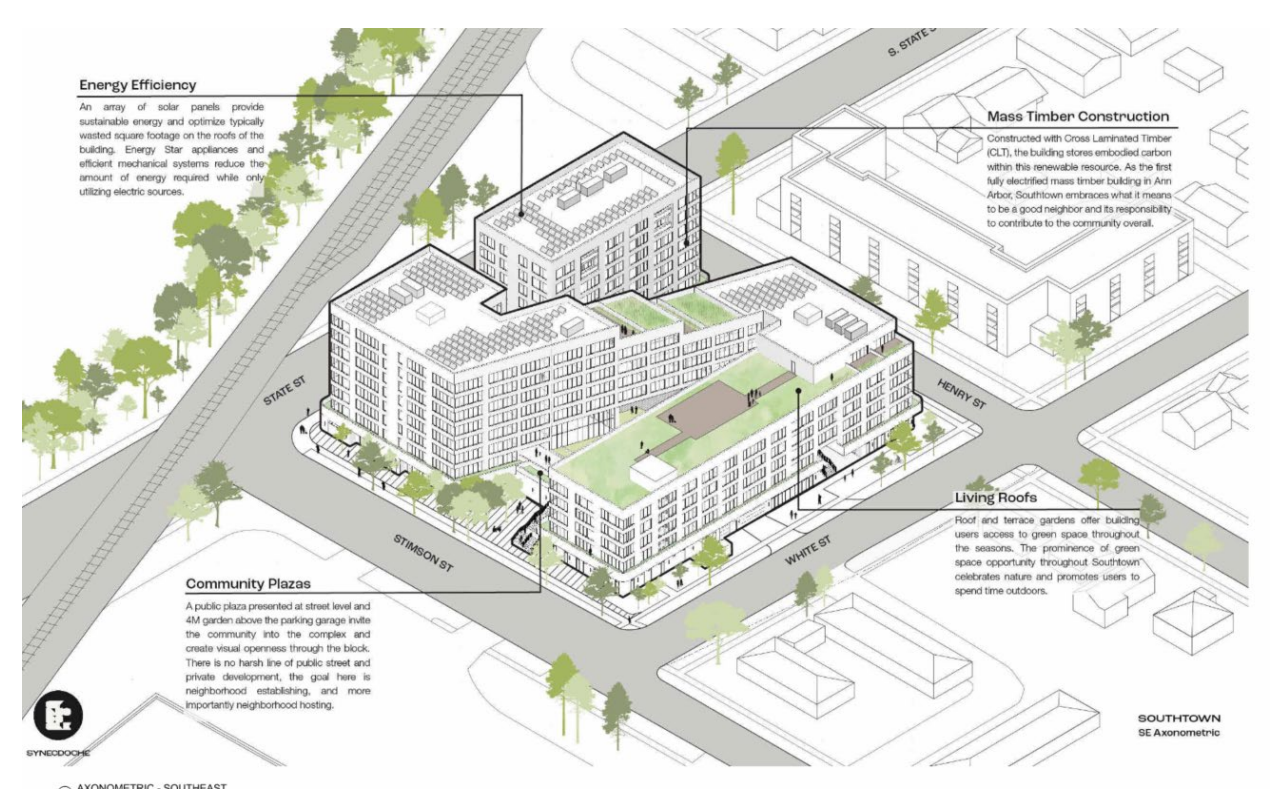
Figure 5: Axonometric Site Layout (from Stimpson/White corner looking NW)

A development standards review is provided below. Notable site plan details include: