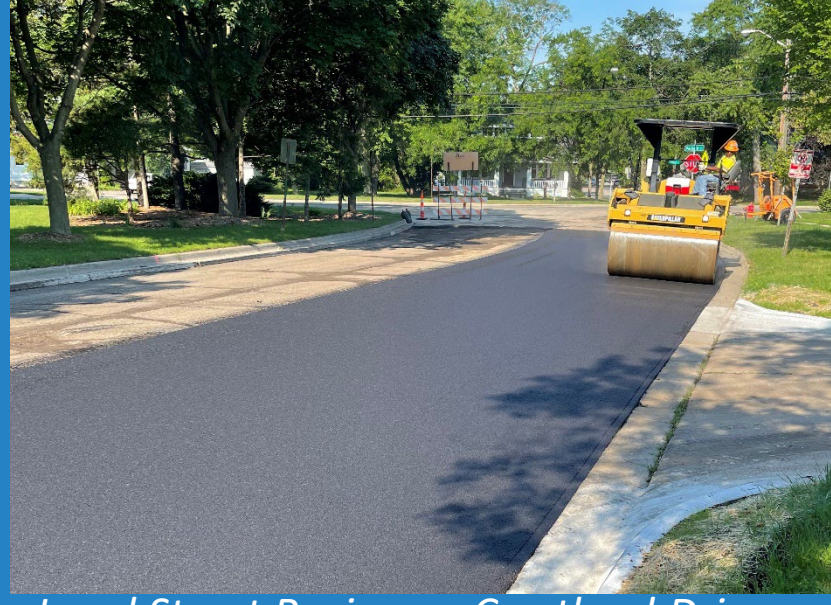
Local Street Paving on Crestland Drive