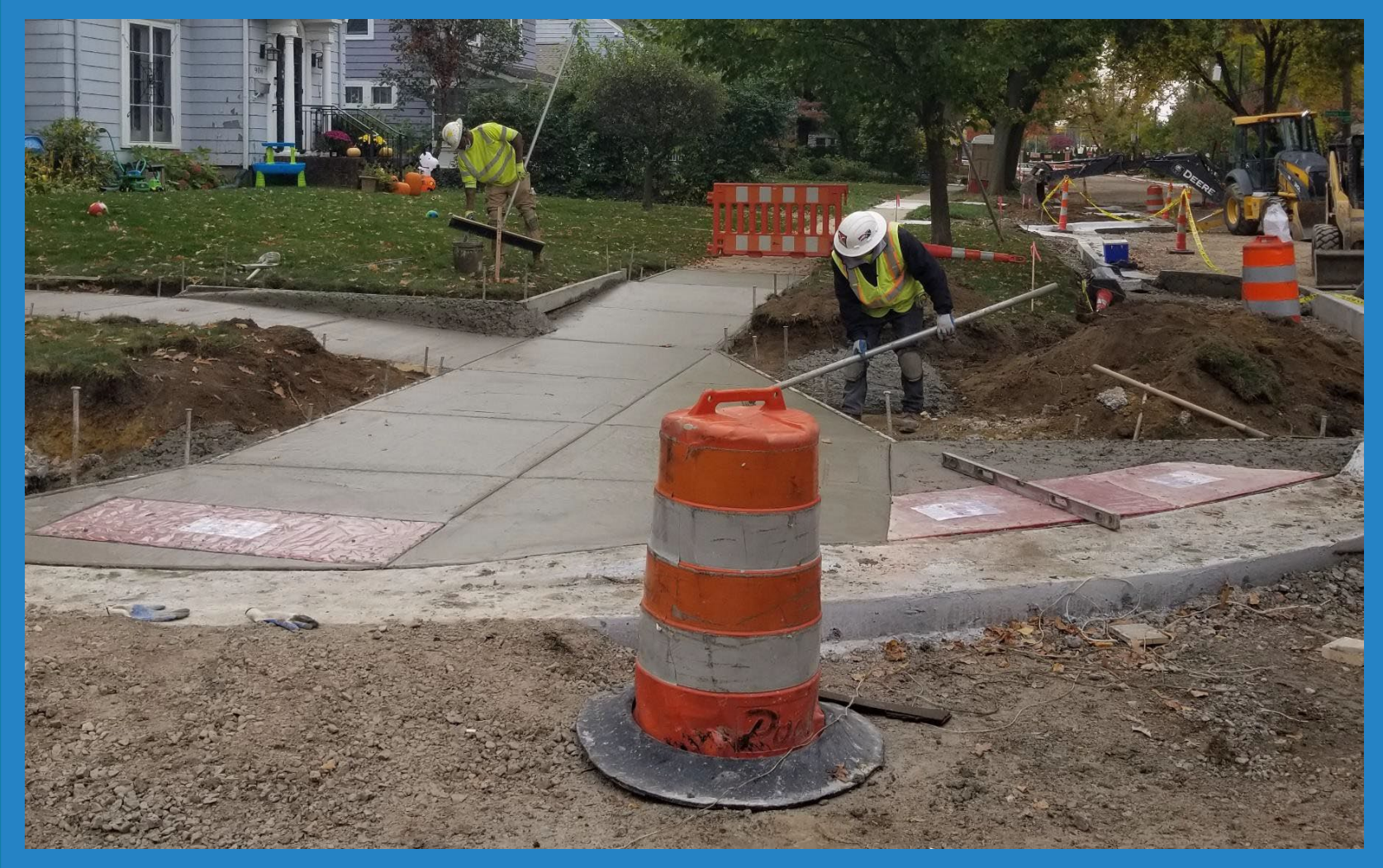
ADA Sidewalk Installation on Granger Ave.