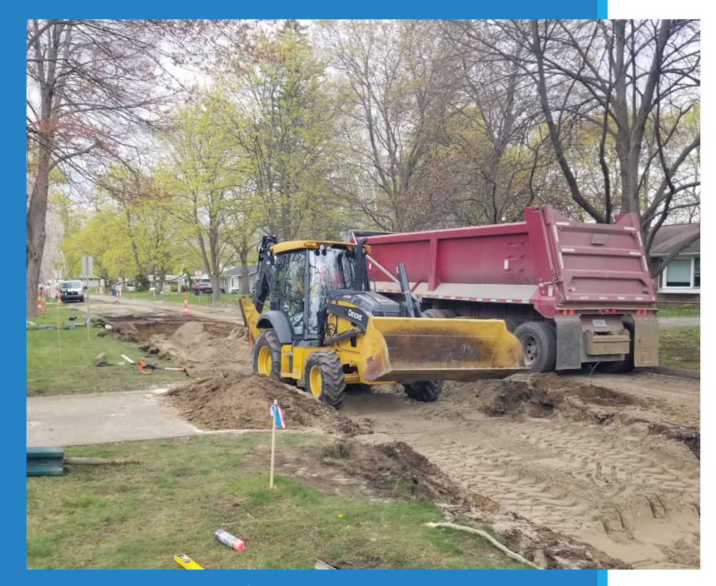
Carmel Street Watermain