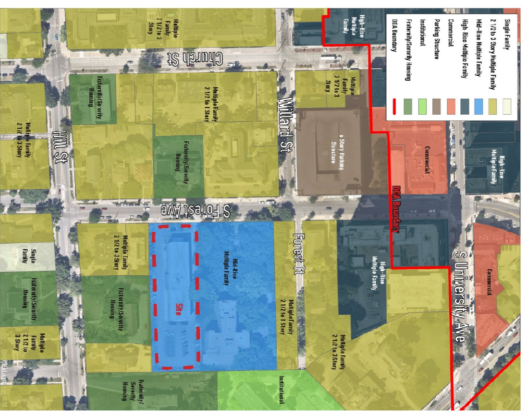
Exhibit 1: Current Land Use

As shown on the map on the left, the existing land uses are not consistent with the Future Land Use Map in the outdated Master Plan. The Future Land Use Plan designates our site and the lot to our north as "Single and Two-Family Housing/Group Housing". When the Master Plan was drafted The Verve site included a 6 story multiple family apartment building and the lot to the north contained a 5 story multiple family apartment building. The next page shows photos of the uses and buildings in the area.