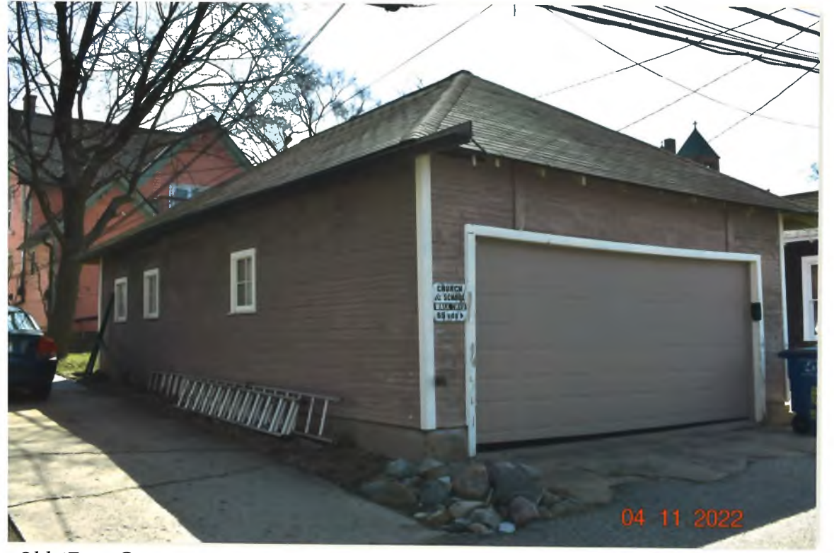
Old 4Four Car Taxi Garage NW Corner - On Alley