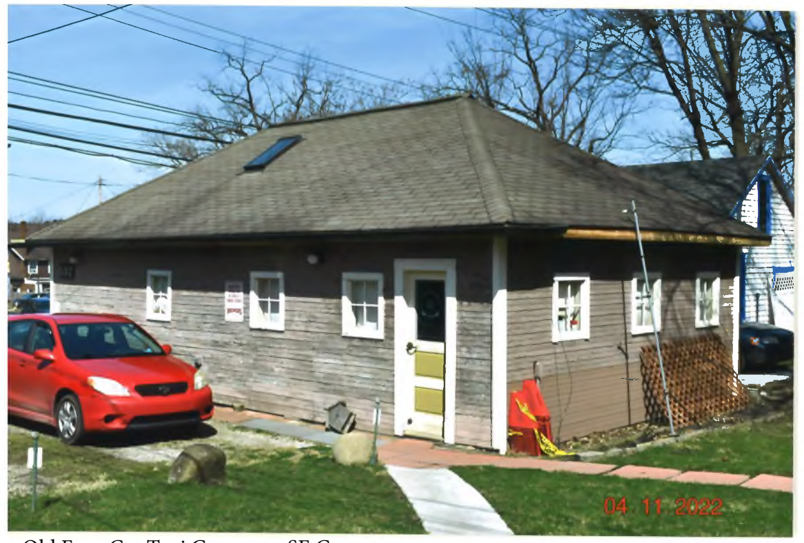
Old Four Car Taxi Garage on SE Corner