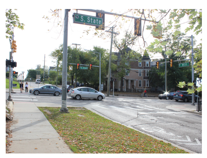
Pedestrian and vehicle interaction at Hill and State Streets intersection.

successful project along with Proposer Suggested Elements. A detailed discussion of activities to be completed are presented in the Work Plan. Finally, exclusions, resources needed for each task, and a schedule are included at the end of this section.