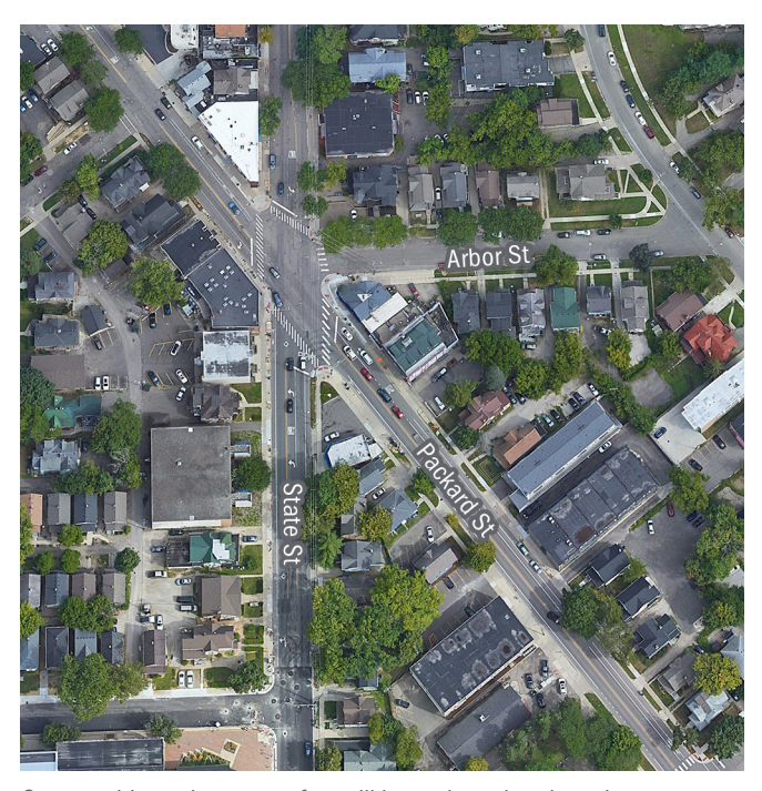
Opportunities to improve safety will be evaluated at the unique intersection of Packard and State with multiple approaches.

Over the past five years on Hill Street within the project limits, an average of 51 crashes per year occurred, with rear-end, sideswipe-same direction, and angle collisions accounting for approximately 27%, 23% and 22% of the crashes, respectively. Although no fatal crashes were recorded, approximately 12% of the crashes resulted in injury on the corridor. Most of the crashes