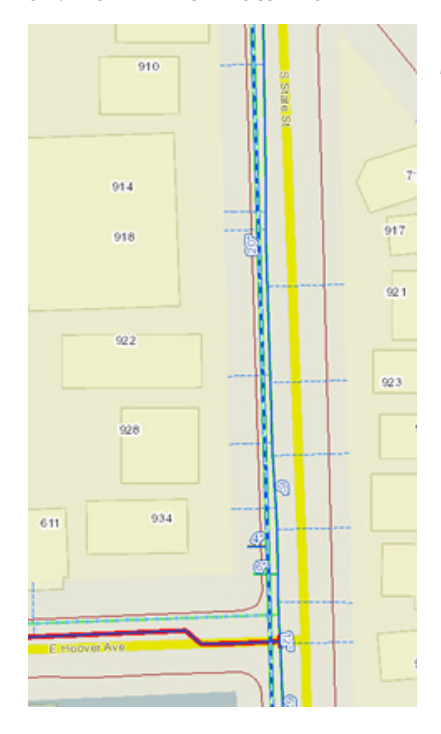
Exhibit 11 Existing 6-inch Water Main Along State Street and New 12-inch Water Main

Replacing this remaining portion of undersized 6-inch water main with a 12-inch water main prior to resurfacing should help increase level of service in the area.