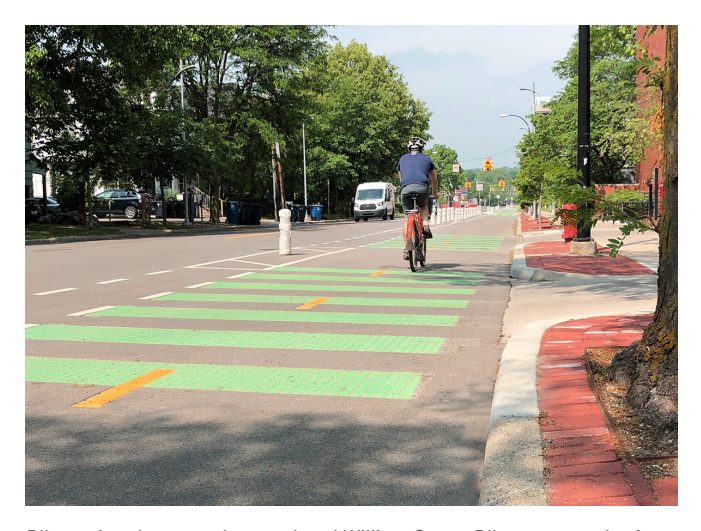
Biker using the recently completed William Street Bikeway near the Ann Arbor Public Library Main Branch designed by the project team.

Wade Trim and SmithGroup have been working indepth with the City of Ann Arbor since 2017, and over that time have gained a detailed working knowledge of