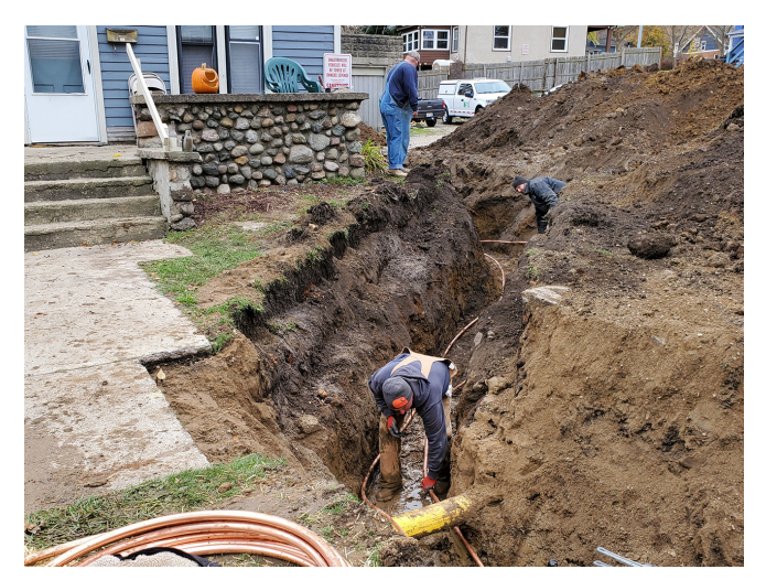
Wade Trim coordinated with the City's Public Works Department to replace lead service lines on Hoover, Greene, and Hill Improvements and suggest a similar approach on State and Hill.

Replacing this remaining portion of undersized 6-inch water main with a 12-inch water main prior to resurfacing should help increase level of service in the area.