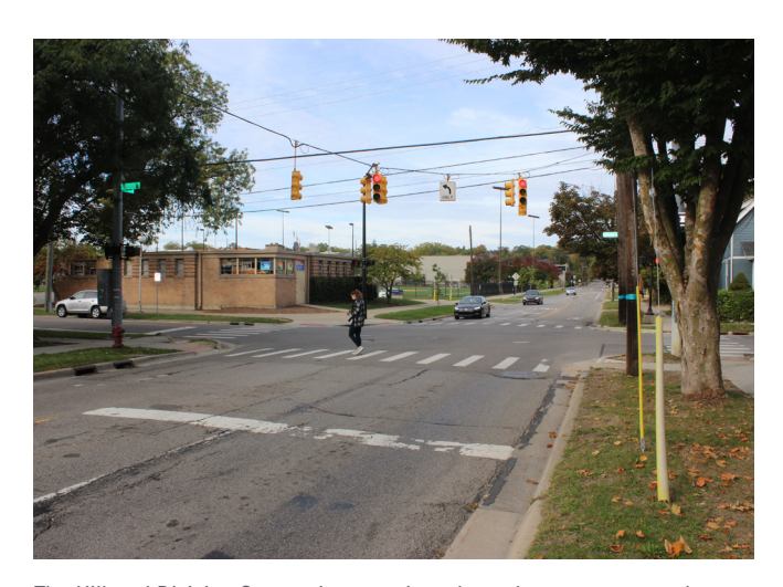
The Hill and Division Streets intersection where three two-way and a single one-way approach intersect.

The resurfacing work on State Street also includes an analysis of existing crosswalks, and the potential addition of new crosswalks. Crosswalks will be evaluat-