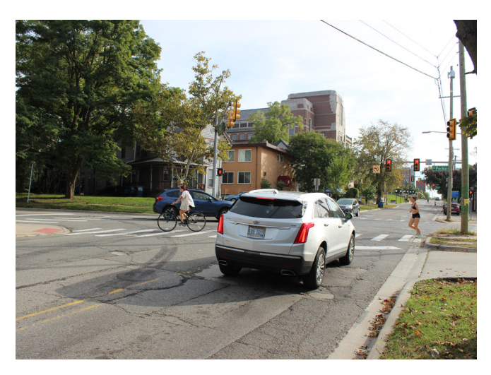
Pedestrian and vehicle interaction at the skewed Hill Street and Packard Road intersection present opportunities for safety improvements.

ed for safety, location, lighting, pavement marking, and signage improvements. We are very familiar with the importance of thoughtful and well-designed pedestrian facilities given the high volume of students, residents, and visitors in this part of town.