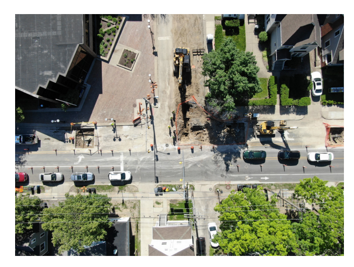
Aerial showing water main isolation valve and water main work at Hoover Avenue and State Street.