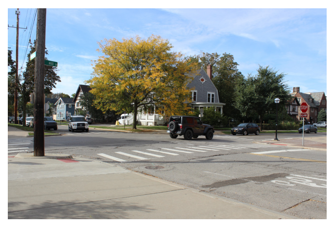
Intersection of Hill and E. University has opportunities to improve pedestrian safety through marking, signing and possible control improvements.

Along the entire Hill Street project corridor, 10 collisions occurred with bicyclists resulting in 6 injuries (1 Type A injury) and 12 collisions involved pedestrians resulting in 11 injuries (1 Type A injury). Similar to State Street, the UD-10 forms showed that many of the non-motorized crashes directly involved a turning vehicle failing to see the pedestrian or cyclist. Safety improvements will be evaluated for non-motorized travel, with a detailed analysis of the Packard to State Street block.