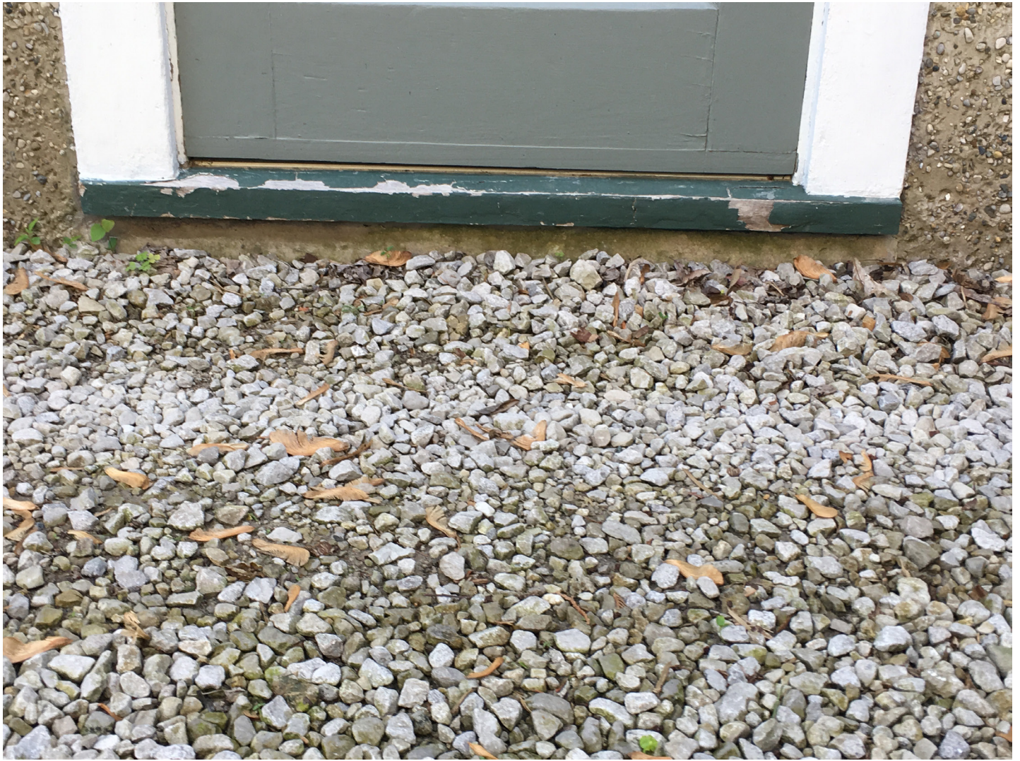
Detail of east side of driveway at door