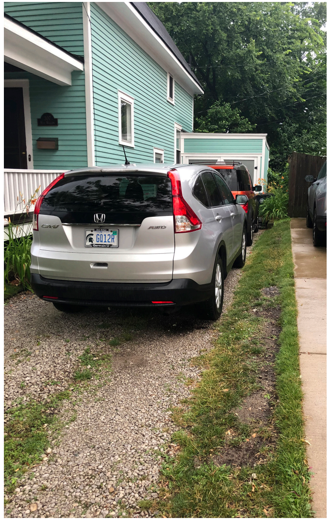
Cars parked single file at the western most edge of the driveway