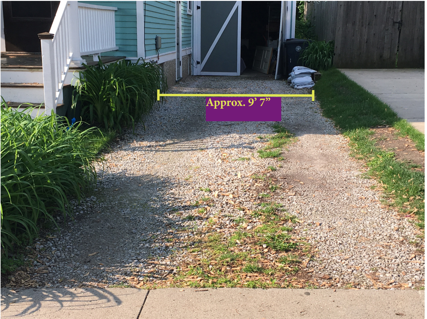
View looking south toward garage