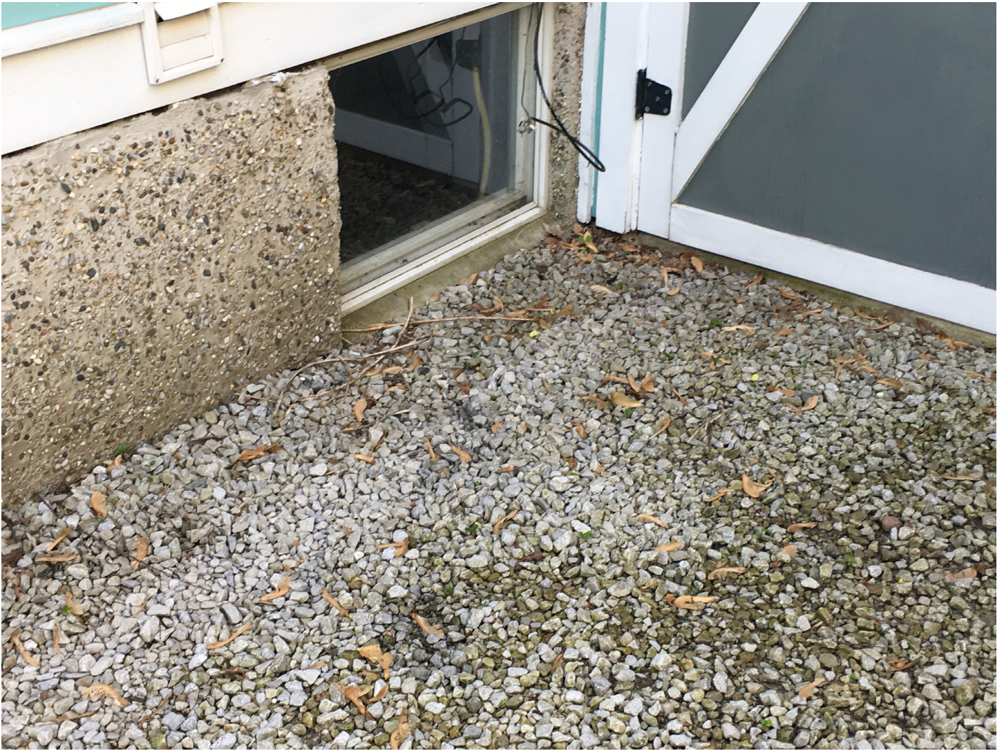
Detail of southeast corner of driveway