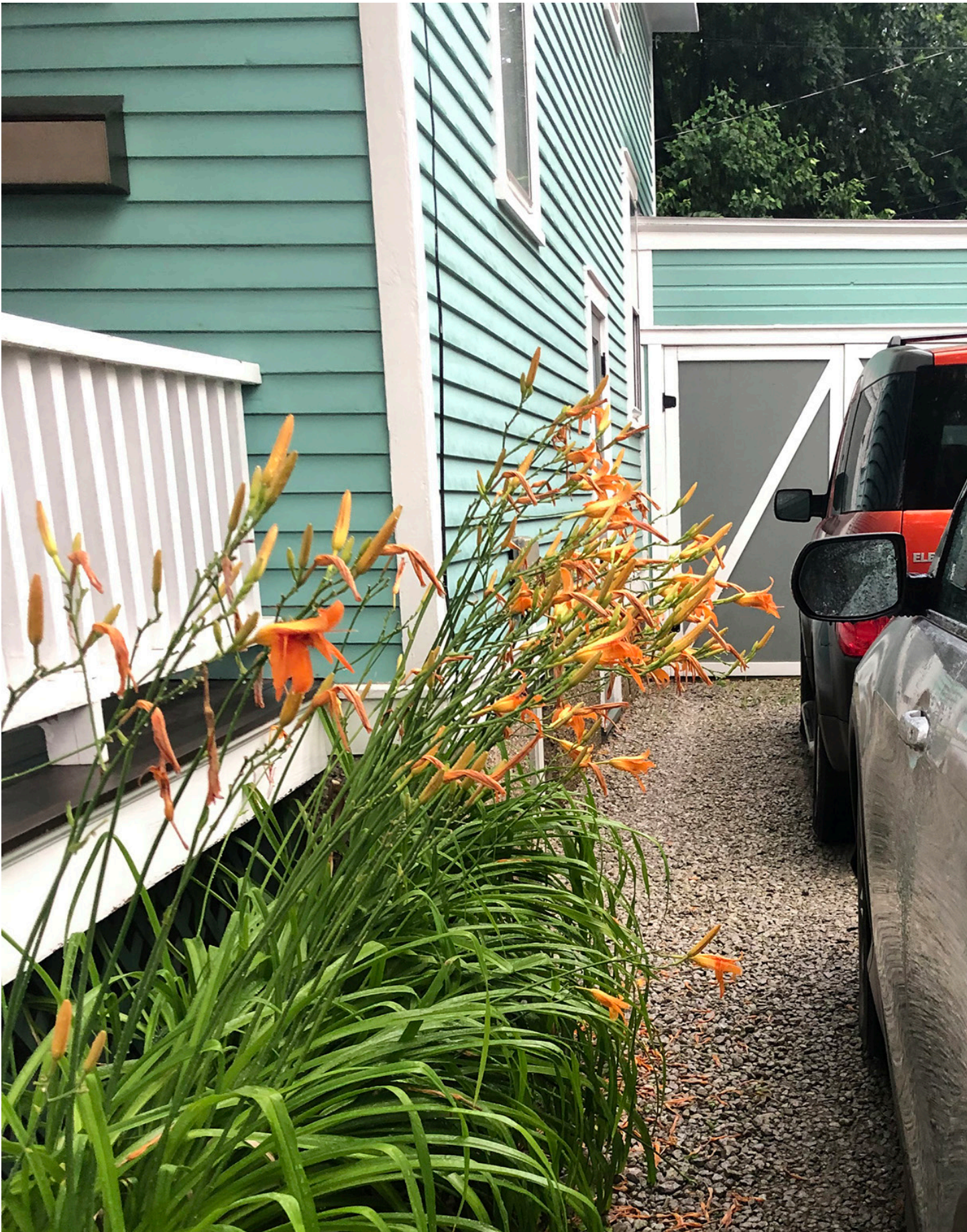
Space between the cars and the house if cars are parked to the western most edge of driveway