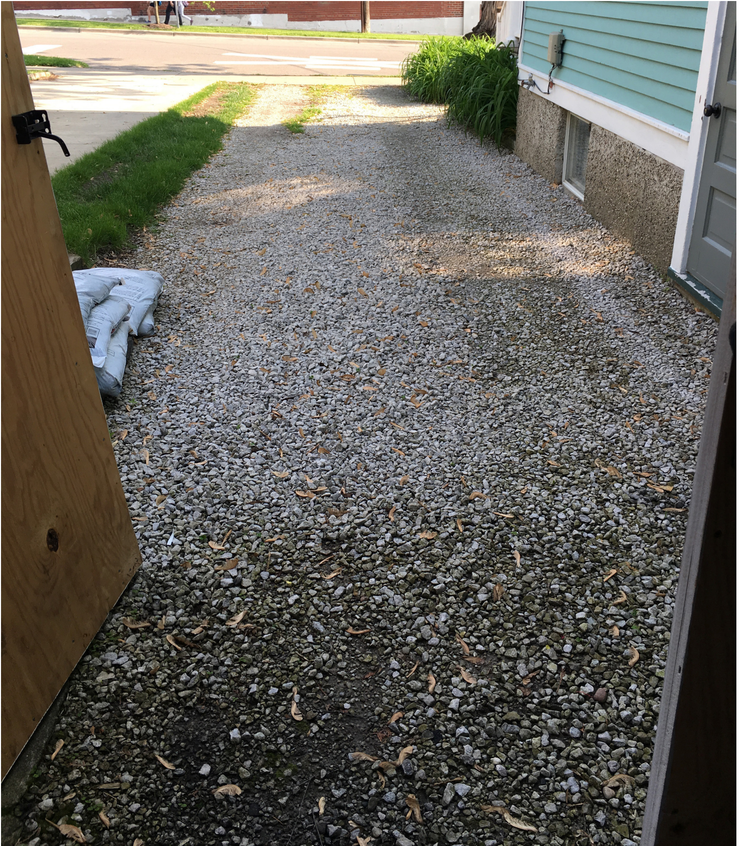
View from garage looking north toward street