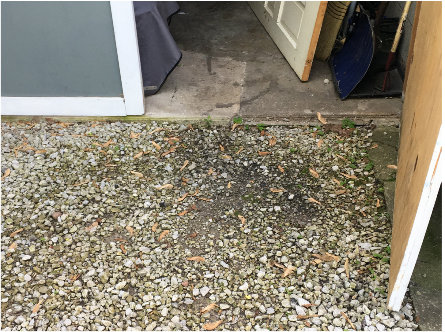
Detail of south end of driveway at garage door