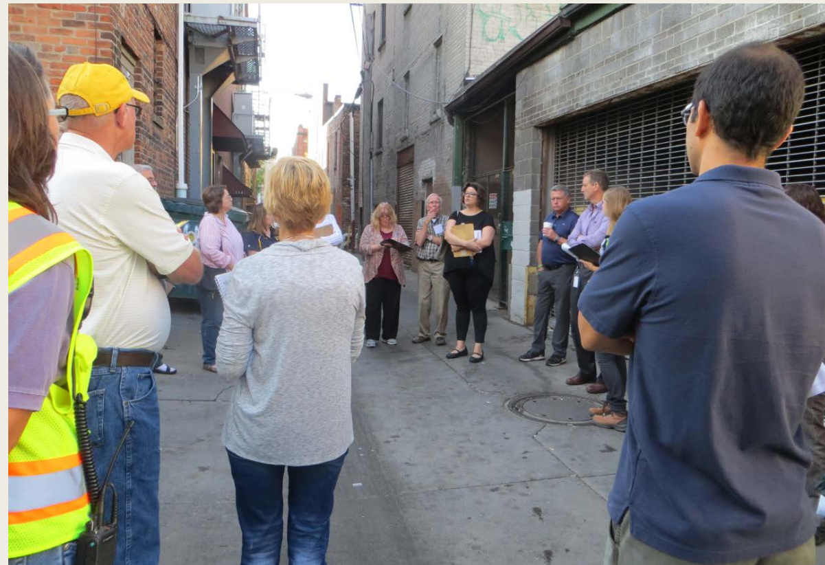
Example walking tour. Downtown Alleys Program.