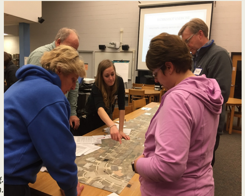
Example of neighborhood workshop meeting. Traffic Calming Program.