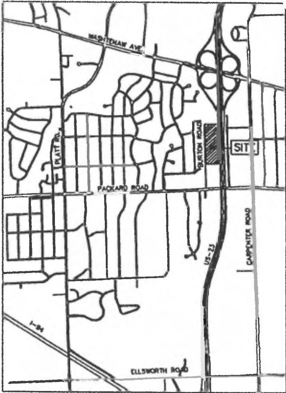
VICINITY SKETCH NO SCALE