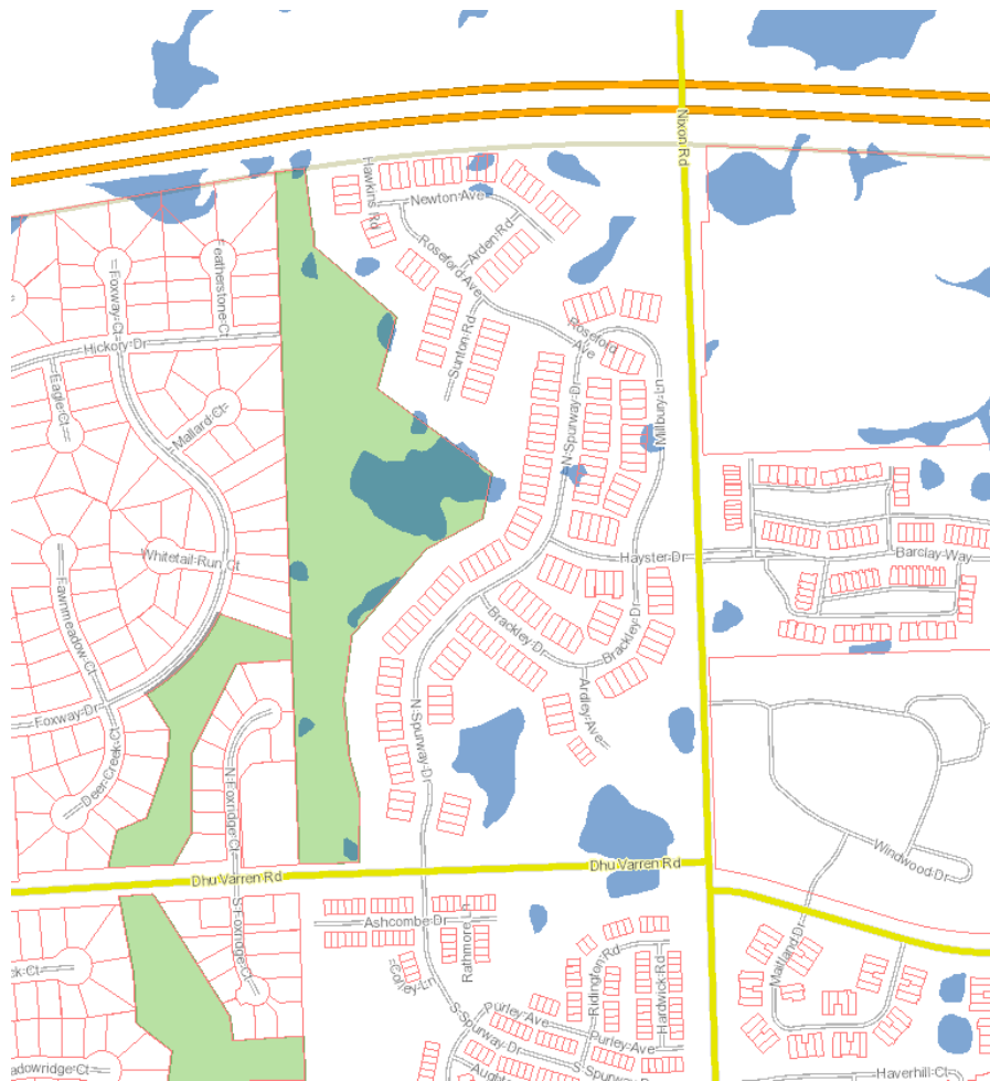
Figure 1 - Buttonbush Nature Area

The land is currently zoned R4A With Conditions, as is the adjacent North Oaks of Ann Arbor site.