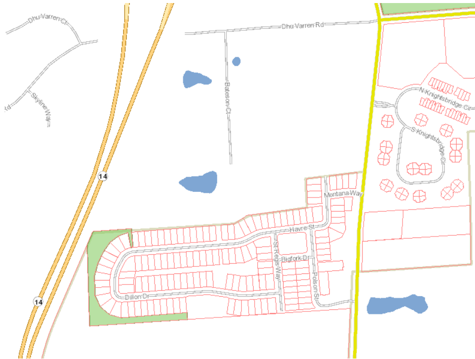
Figure 2 - Hickory Nature Area

Approximately 2 acres of natural area was donated by Pulte Homes of Michigan, LLC as part of their North Sky development. The Parks Advisory Commission passed a resolution to name the property on August 20, 2019. More background about Hickory Nature Area can be found in an August 20, 2019 memo from the Parks & Recreation Services Manager. The land is currently zoned R1D as is the adjacent North Sky site.