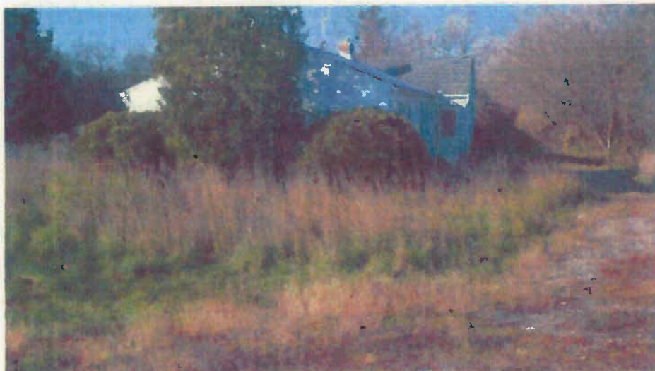
Overgrowth visible from street