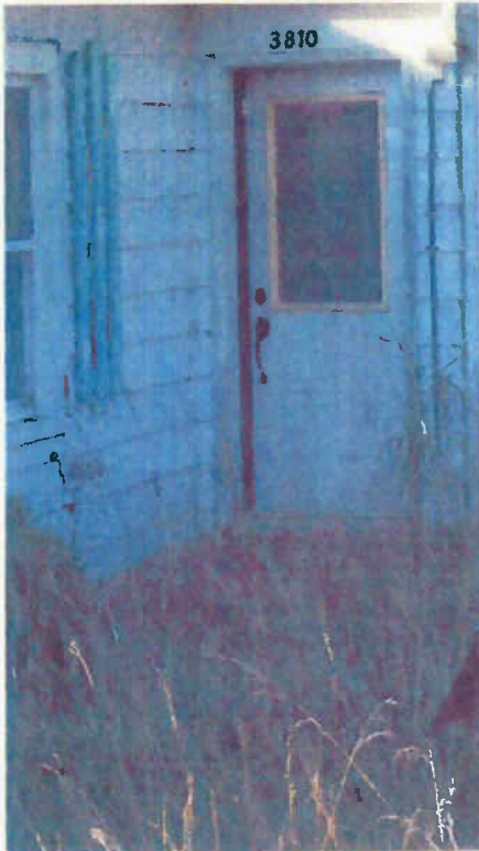
Open doors & siding issues