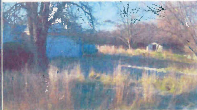
tank, garage & out building