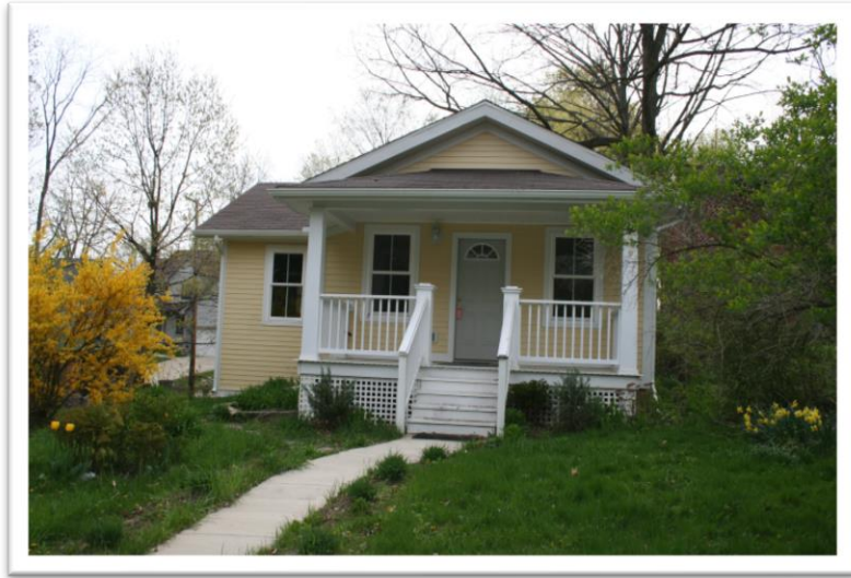
639 Fifth Street (2008 Survey Photos)