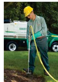
LEFT: INJECTING TREES WITH A SPECIALIZED TOOL HELPS TO MINIMIZE ENVIRONMENTAL EXPOSURE; RIGHT: SOIL INJECTIONS CAN PROTECT A TREE FOR AN ENTIRE GROWING SEASON.