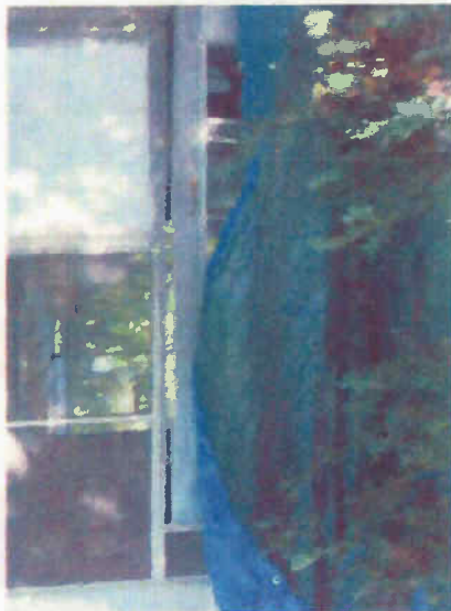
Sun Room and Roof Tarp

Owner contacted Construction Services in August of 2012, promising to submit full construction drawings. That has been my last contact with the owner. This house is a neighborhood nuisance that has garnered many complaints from Brookwood Place homeowners. Staff recommendation is to require demolition subsequent to the 20-day appeal period.