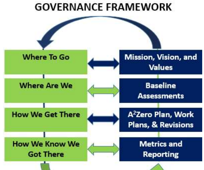
Figure 1: Governance Framework that notes the inputs that help answer where we want to go, where we are, how we propose getting to our goal, and how we'll know we've achieved our goal.

Guiding the process outlined below is a Governance Framework (Figure 1). The framework outlines what inputs tell us where we are going, where we are, how we propose getting from where we are to where we want to go, and how we will know we have achieved our goal. This governance document touches on each of these areas but is most prominently grounded in the third section, “How We Get There,” and especially the elements related to the A 2 Zero Plan and revisions / updates. This document also discusses how we gauge performance in regards to meeting our goal through indicators and metrics tracking and reporting.