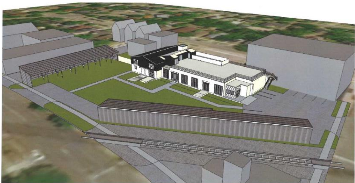
Figure 2: Original Perspective Sketch

The original design plan application illustrates the existing conditions and proposed redevelopment.