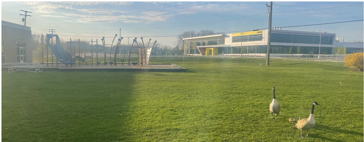
Some Geese walk by Progress Park and Sartorius

There is a public school for children with special needs near the center of Research Park. It is called Progress Park. It is run by the Washtenaw Intermediate School District. After school hours, it also serves as a public green space.