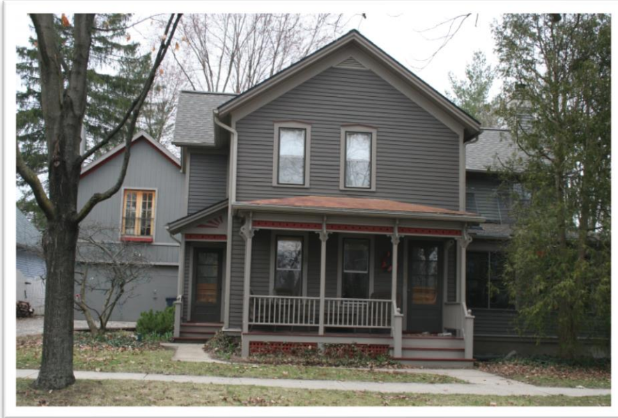
520 Sixth Street (2008 Survey Photos)