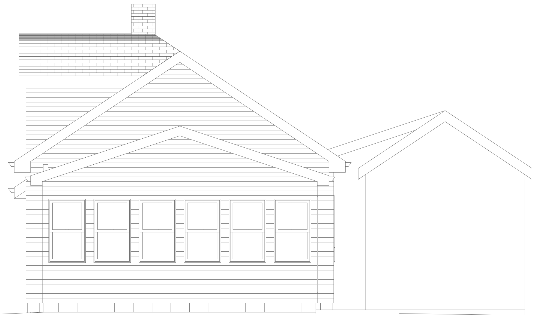
2 EAST ELEVATION A08 NOT TO SCALE