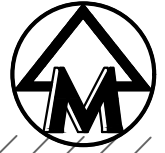
EXHIBIT A CONT.