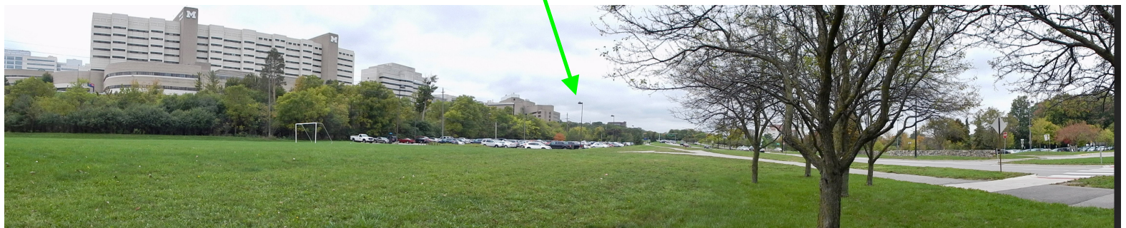
Fuller Park, looking southwest toward University Hospital